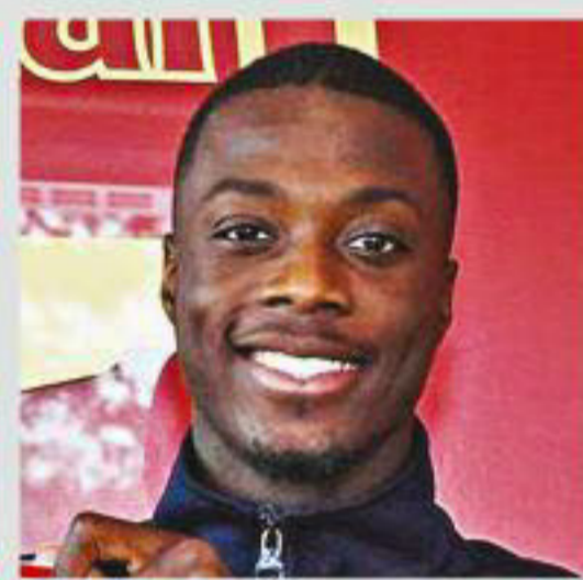
Nicolas Pepe Lille to Arsenal €79 million