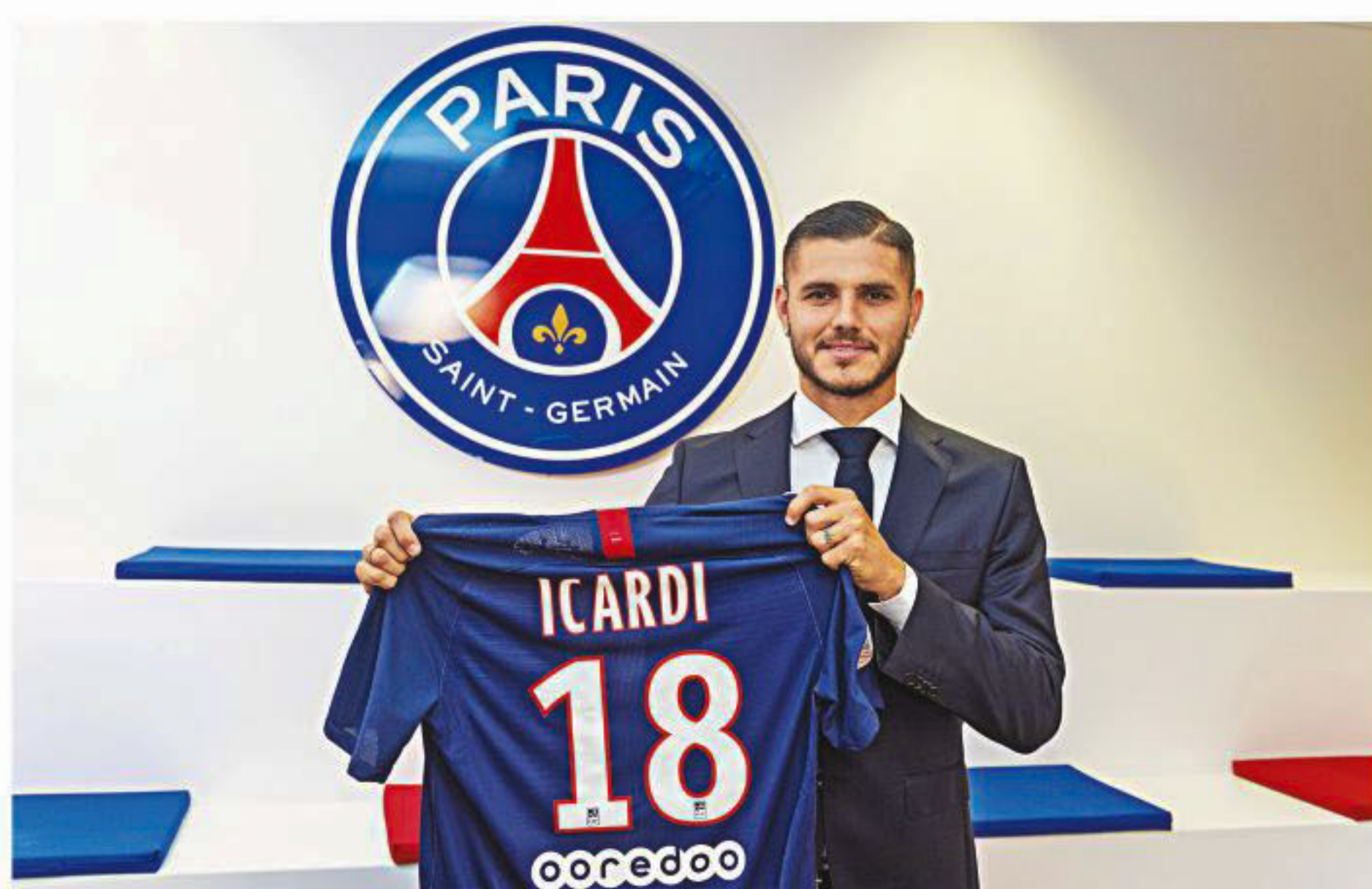
Argentine forward Mauro Icardi sealed a surprise loan move from Inter Milan to Paris Saint-Germain in the biggest deal of deadline day on Monday night.

Pogba excited speculation earlier in the day when he dropped out of France's two upcoming Euro 2020 qualifiers with an "ankle problem". Real did do one deal with PSG. It even involved a World Cup winner, but the marquee name was the Madrid