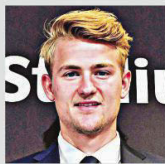
Matthijs de Ligt Ajax to Juventus €75 million