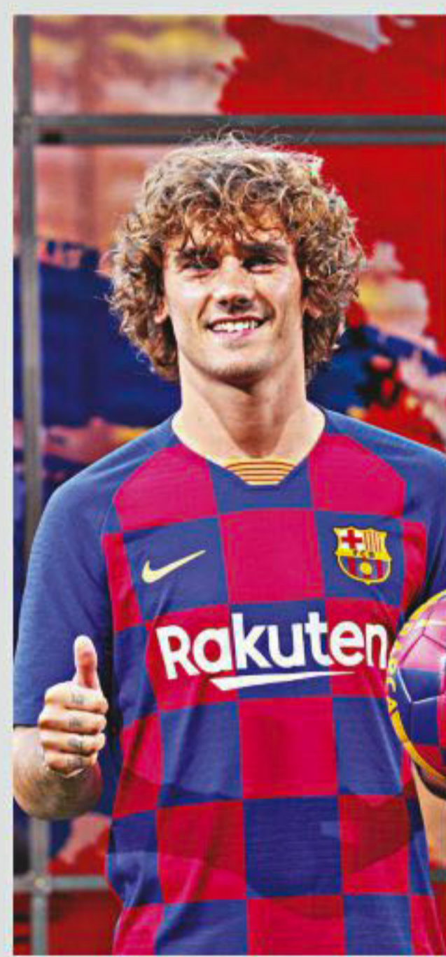
Antoine Griezmann Atletico to Barcelona €120m