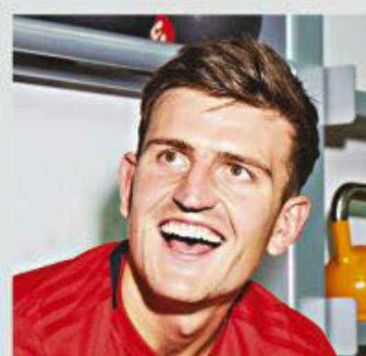
Harry Maguire Leicester to Man Utd €88m