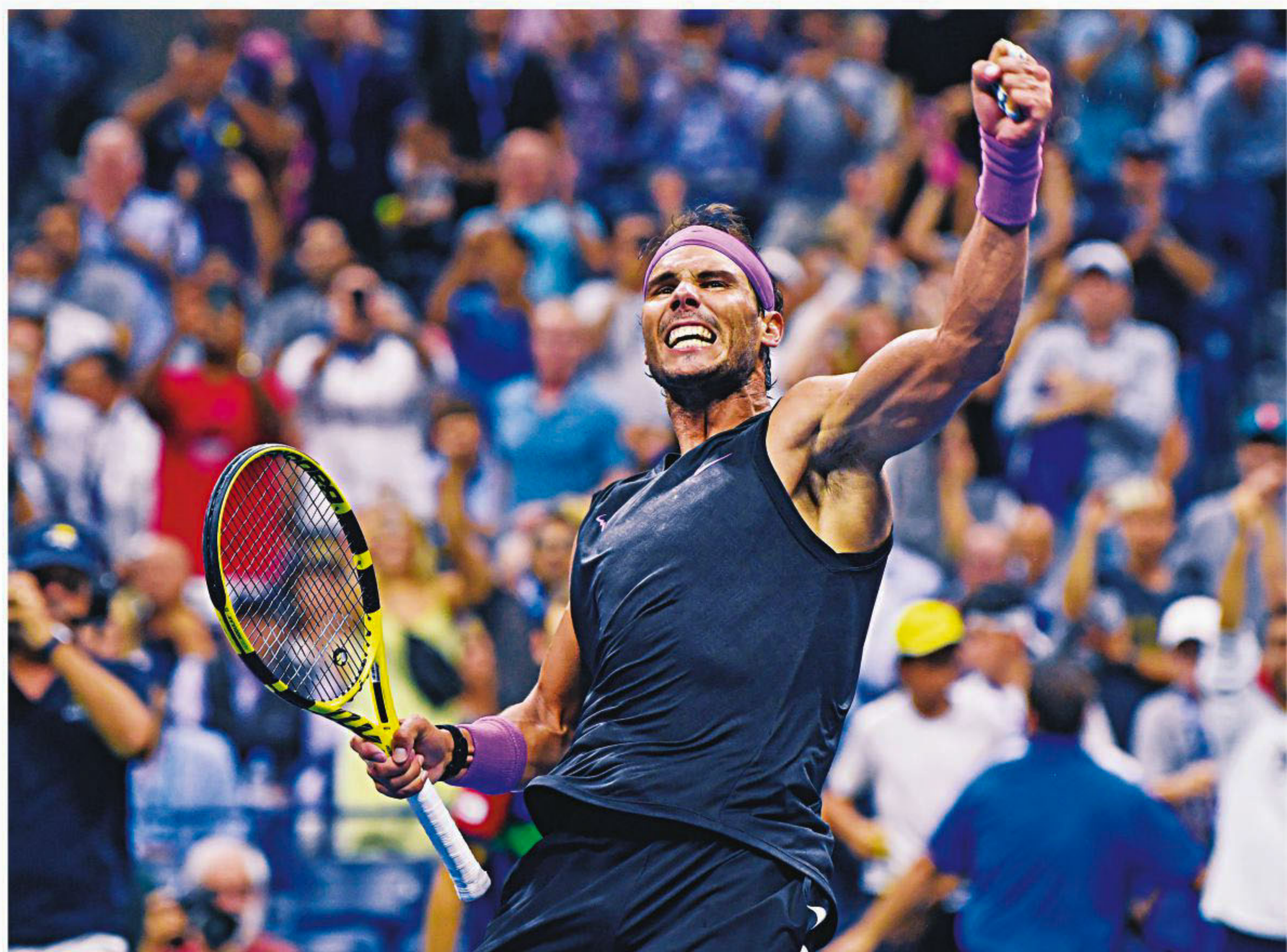
Rafael Nadal defeated 2014 champion Marin Cilic 6-3, 3-6, 6-1, 6-2 on Monday in the US Open last 16 with an electrifying performance at Flushing Meadows, the highlight of which was a shot around the net which took him to match point.

"He was up a break and then I recovered really quickly and I felt great after that."