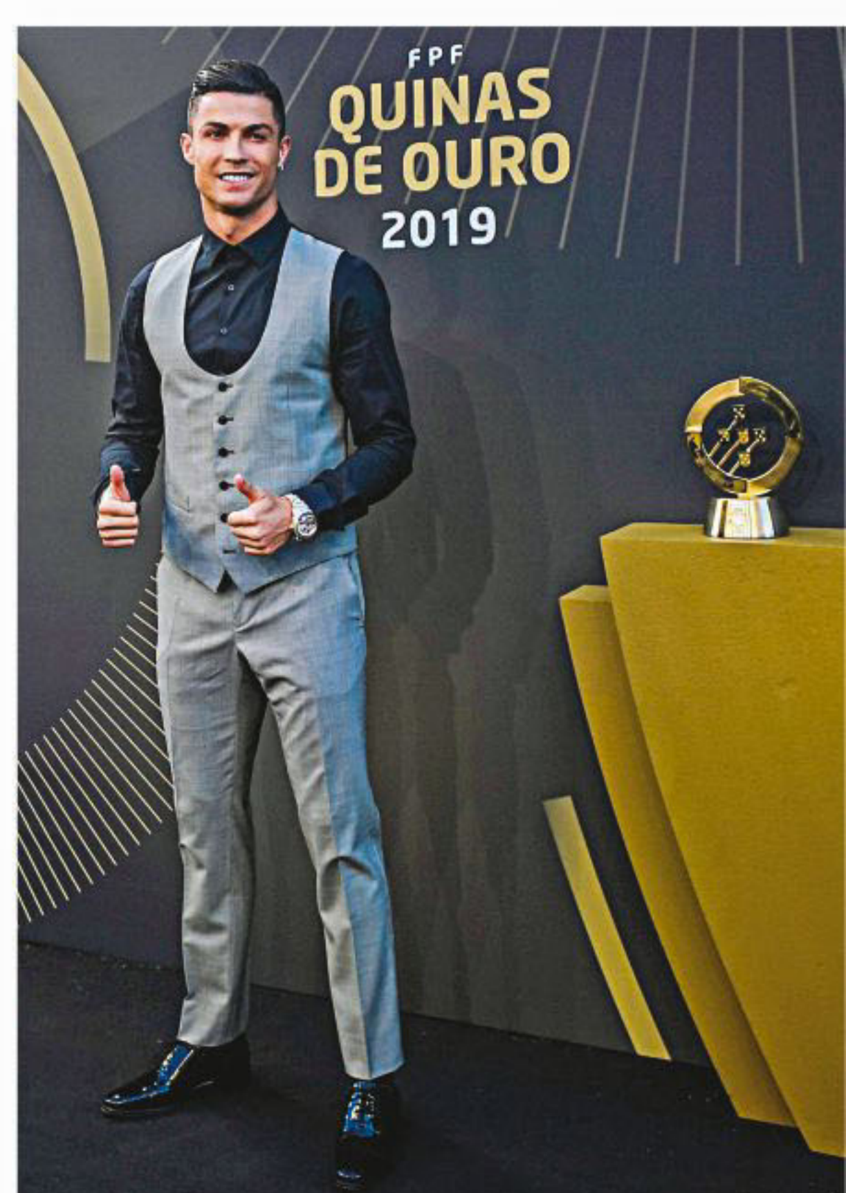
Cristiano Ronaldo lifted the Portuguese Player of the Year award for the 10th time in his career in Lisbon, beating out Joao Felix and Bernardo Silva.

Galatasaray confirmed the signing of Colombian striker Radamel Falcao.