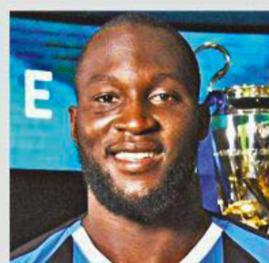
Romelu Lukaku Man Utd to Inter Milan €78m