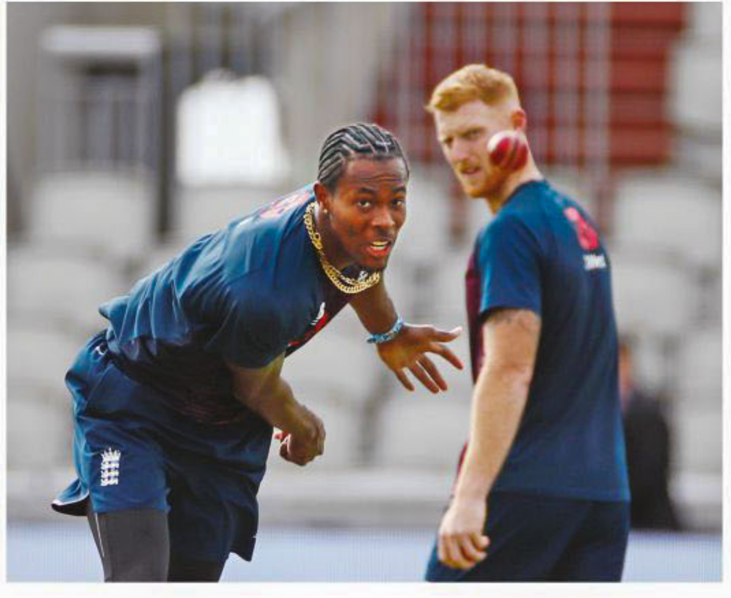
England pacer Jofra Archer -- who took Australia lynchpin Steve Smith (R) out of the equation in the third Test -- and all-rounder Ben Stokes (C), who singlehandedly levelled the series in Headingley, have had a telling impact so far. But Smith, returning for the fourth Ashes Test starting today, will be looking to reassert his supremacy.

voice on your shoulder. You've got to have a good strategy and he works the game out better than anyone I've ever met in my life," said Langer. "If anyone's going to get over any little demons it'll be Steven." England will make one change from the team which beat Australia at Headingley, with Craig Overton replacing Chris Woakes in the seam attack. Captain Joe Root said that Somerset seamer Overton would get his chance for a fourth Test appearance, having last featured in New Zealand in March 2018. The only other adjustment England will make in the Test is in their batting order, with Joe Denly set to move up to open the batting, while Jason Roy moves down to number four. England pacer Stuart Broad, the hosts' leading bowler this series with 14 wickets at 25.35, was eager to see Smith face Archer again. "I'm sure when Steve comes in Jofra will be in (England captain) Joe Root's ear wanting the ball," Broad said.