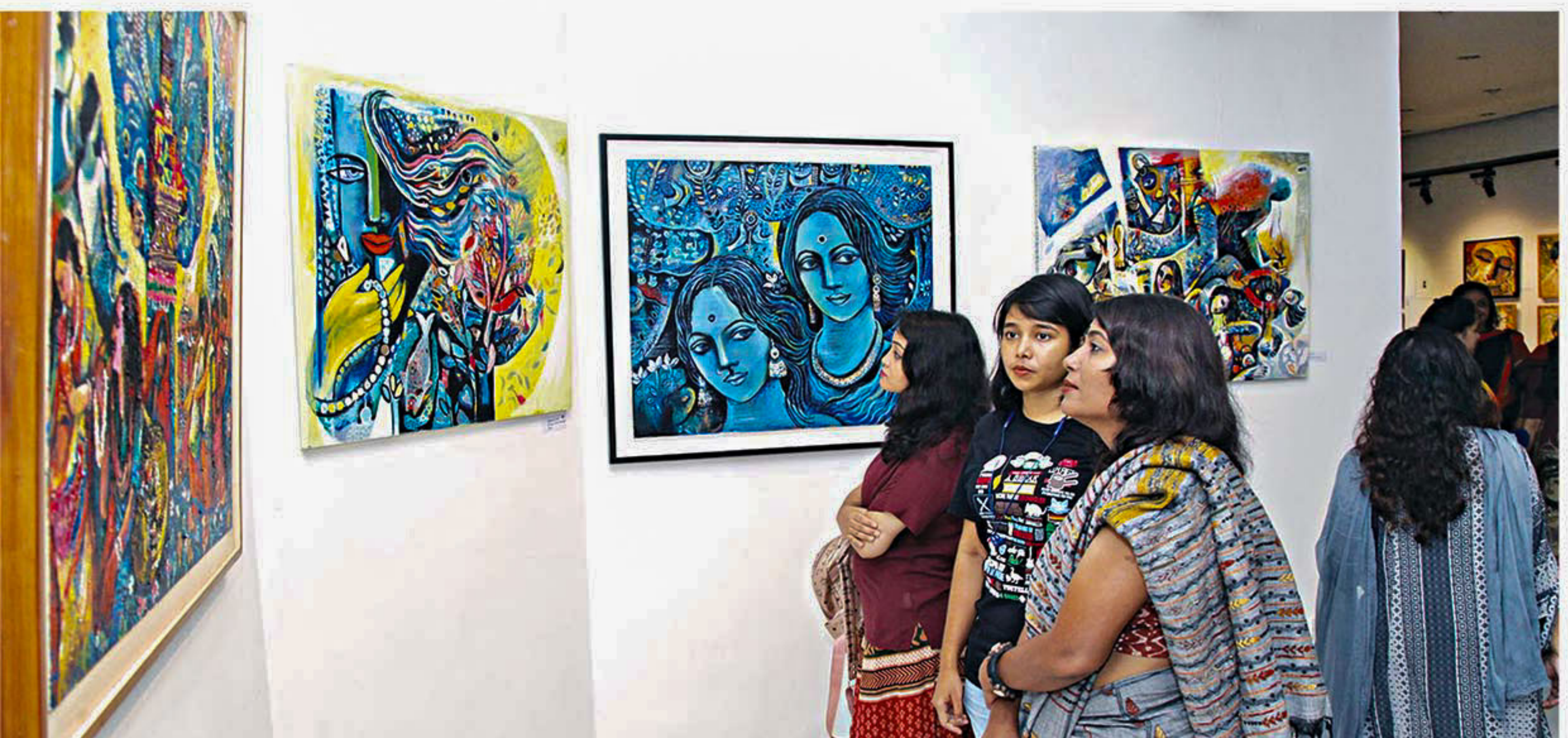
The artworks at the exhibition showcase traditional themes of Bangladesh and India.