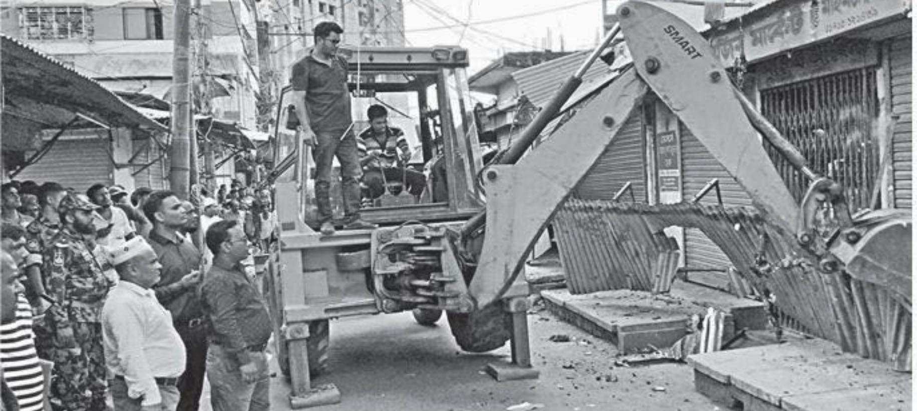
A mobile court, jointly conducted by Mymensingh City Corporation and local administration yesterday demolished illegal structures in Mechhua Bazar area, located at the entrance of the city.