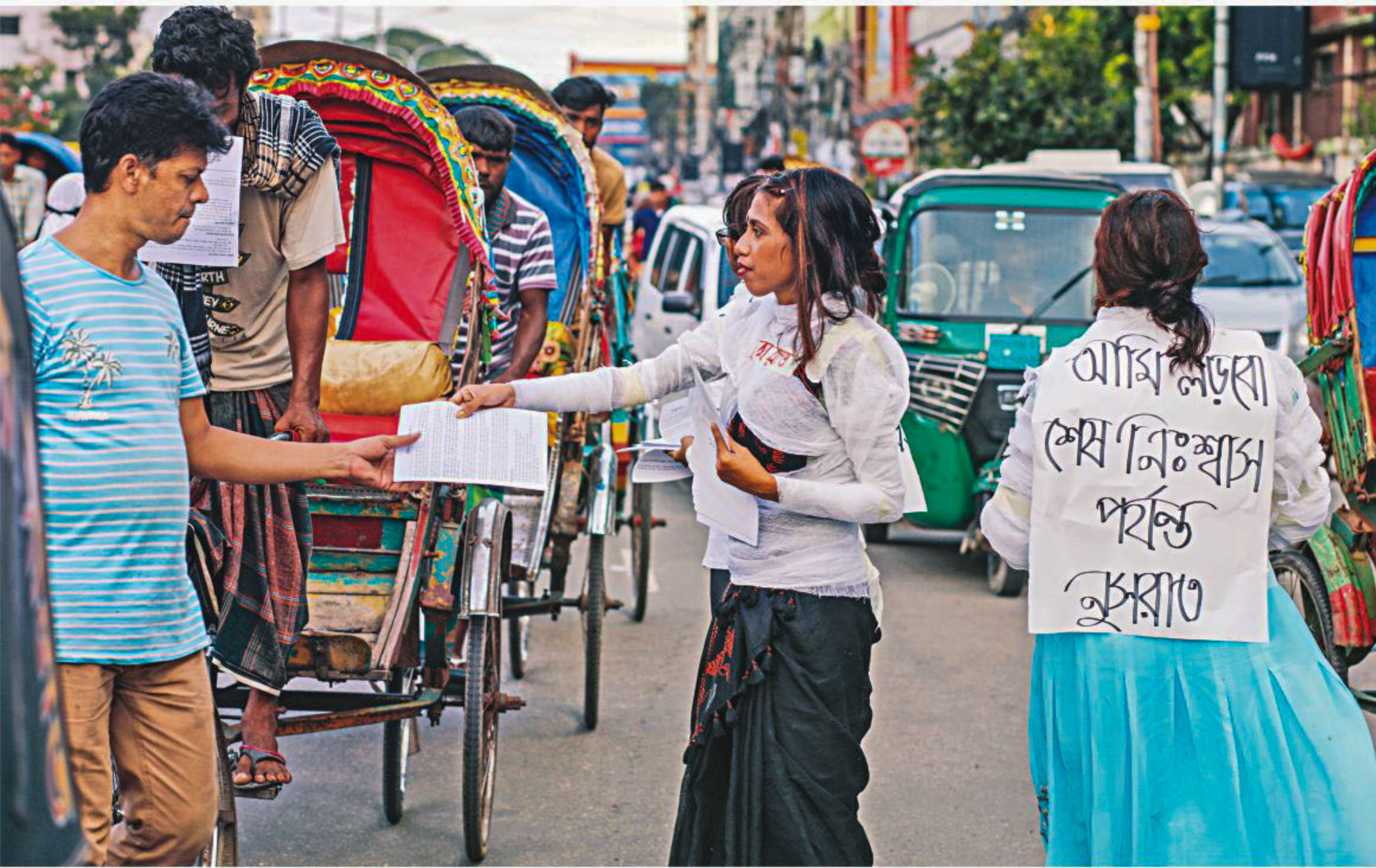
Demonstrators in burn dressing distributed leaflets to passers-by in Dhankhondi, as part of Naripokkho's campaign against rape and sexual harassment.