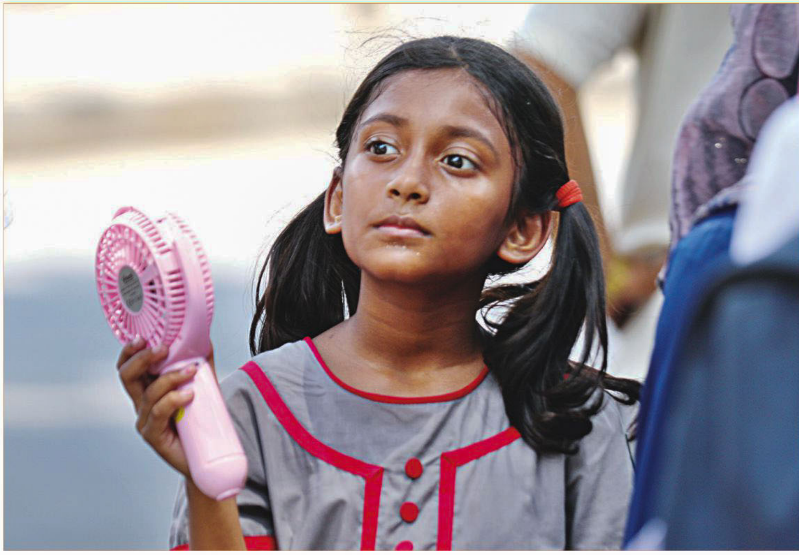
To get some respite from the scorching summer heat, a schoolgirl holds a battery-powered fan near her face in the capital's Indra Road area. High temperature and humidity have been taking their toll on people for the last few days. The photo was taken yesterday.