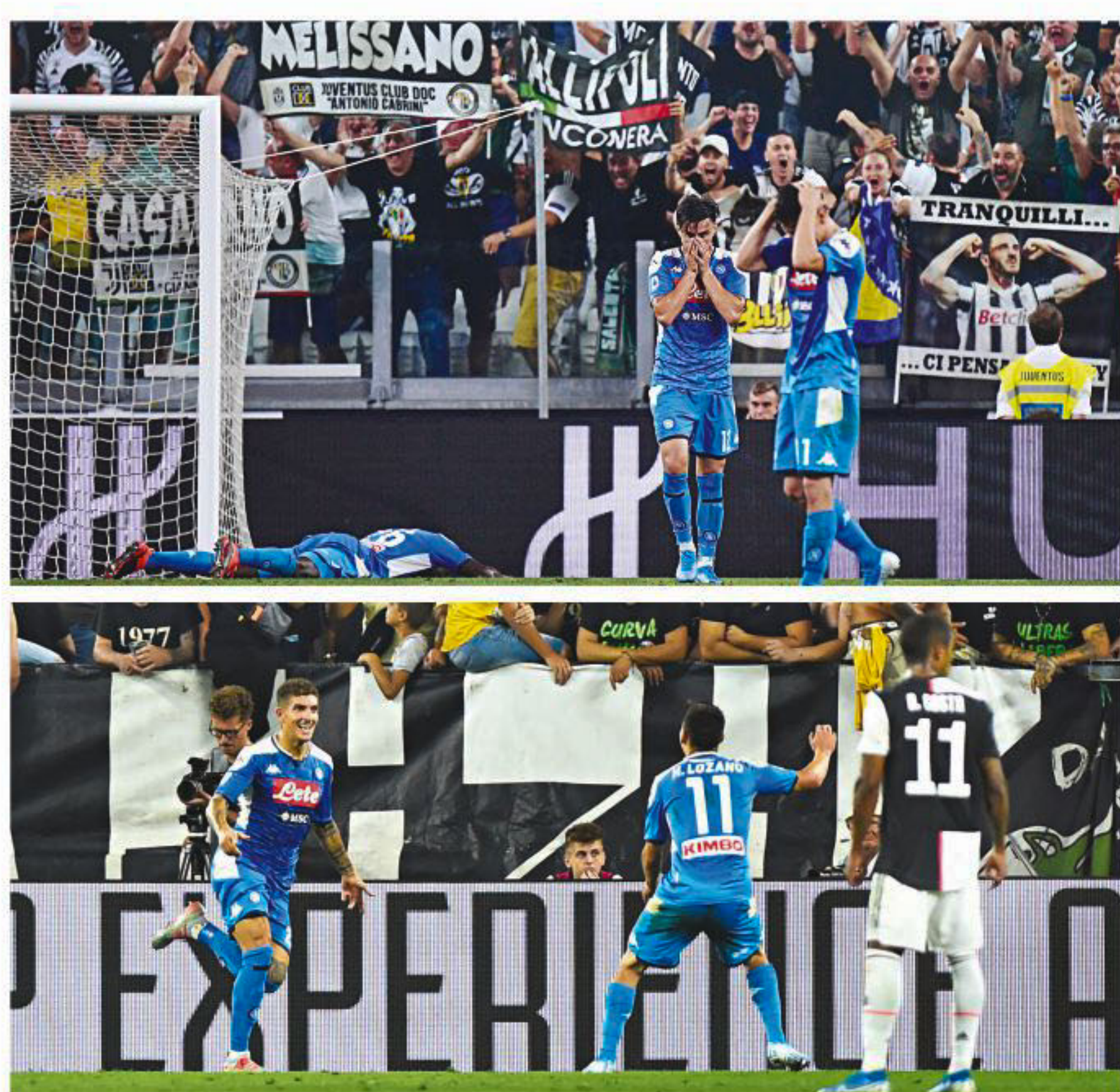
(Clockwise from R) Cristiano Ronaldo pulled out a cheeky celebration after putting Juventus up 3-0 against Napoli in the 62nd minute of their Serie A encounter on Saturday night, asking the crowd to tone down on celebrations and gesturing that VAR would still have to perform relevant checks. However, an inspired Napoli did the unthinkable and levelled the scoreline, with Giovanni di Lorenzo scoring the third in the 81st minute. When it seemed that the drama was done, however, Napoli defender Kalidou Koulibaly kicked the ball into his own net in the 92nd minute and immediately fell to the ground, perhaps hoping it would open and swallow him up. After all, he had just cost The Partenopei the match against their main rivals for the Serie A title.