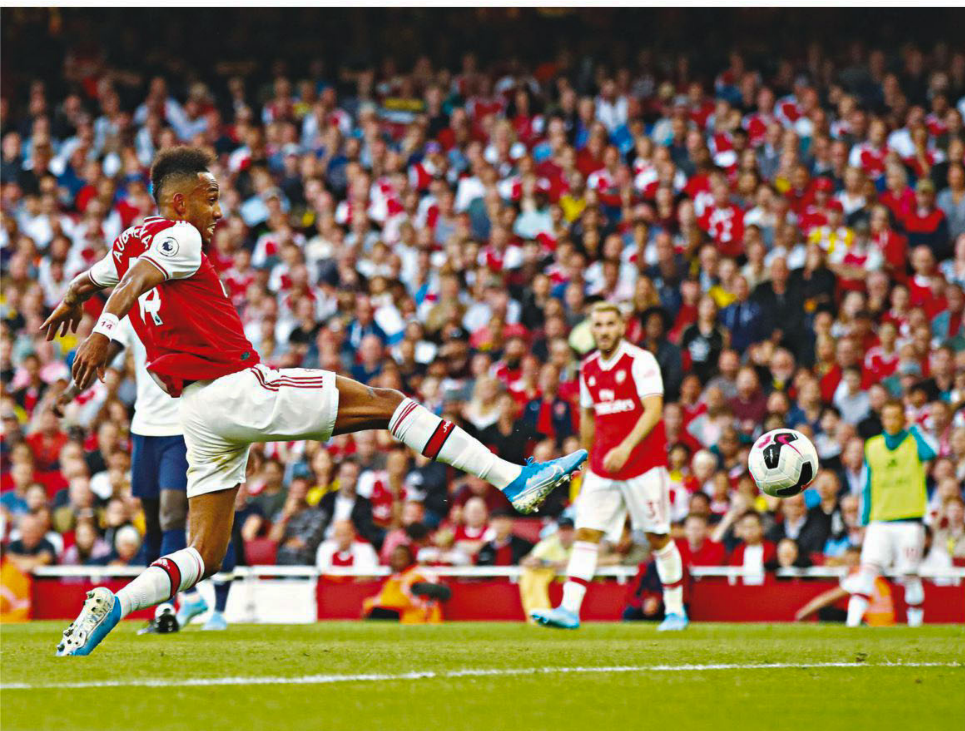
Pierre-Emerick Aubameyang stretches to expertly turn in Matteo Guendouzi's cross and equalise for Arsenal in the 71st minute of the North London Derby. Tottenham had secured a 2-0 lead going into half-time during the Premier League but the points were ultimately shared between the bitter rivals.