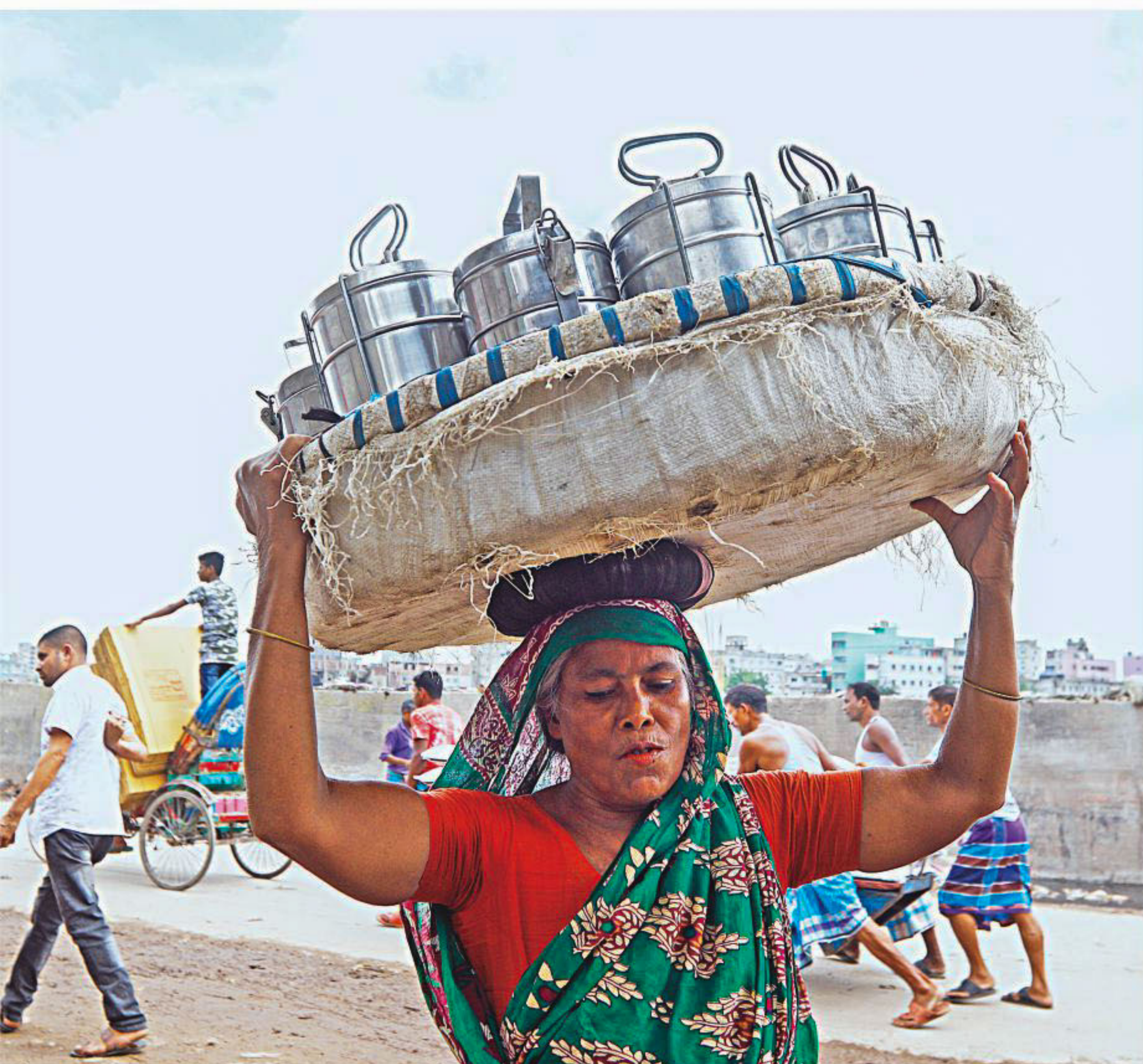
LUNCH FROM ACROSS THE RIVER ... A woman gets off the boat at Soarighat, carrying lunchboxes on her head that she would take to Old Dhaka to sell to employees of different offices. She brings home-cooked meals for some 40 people every day in two trips from Keraniganj, selling each box for Tk 40-60. The photo was taken recently.