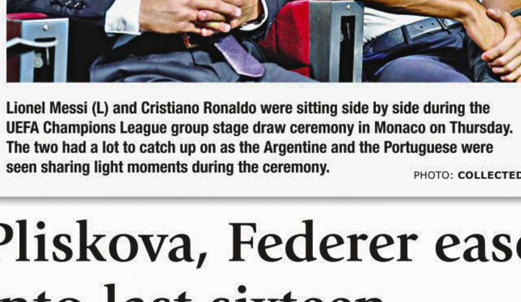
Lionel Messi (L) and Cristiano Ronaldo were sitting side by side during the UEFA Champions League group stage draw ceremony in Monaco on Thursday. The two had a lot to catch up on as the Argentine and the Portuguese were seen sharing light moments during the ceremony.

"We shared the stage 15 years, me and him," Ronaldo, sitting next to Messi, said at the UEFA Champions League group-stage draw.