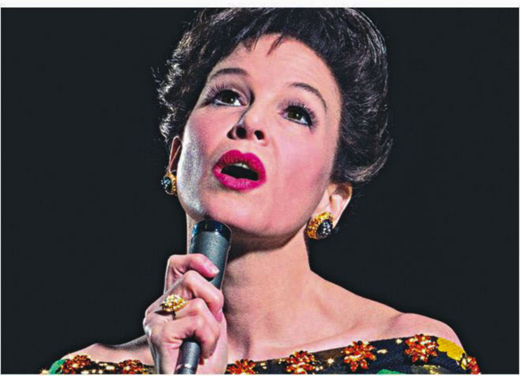
A still from 'Judy', starring Renee Zellweger.

Sam Smith and Rufus Wainwright will each duet with Renée Zellweger on the 'Judy' soundtrack. The biopic of the same name, in which Zellweger plays Judy Garland, will hit theaters on September 27.