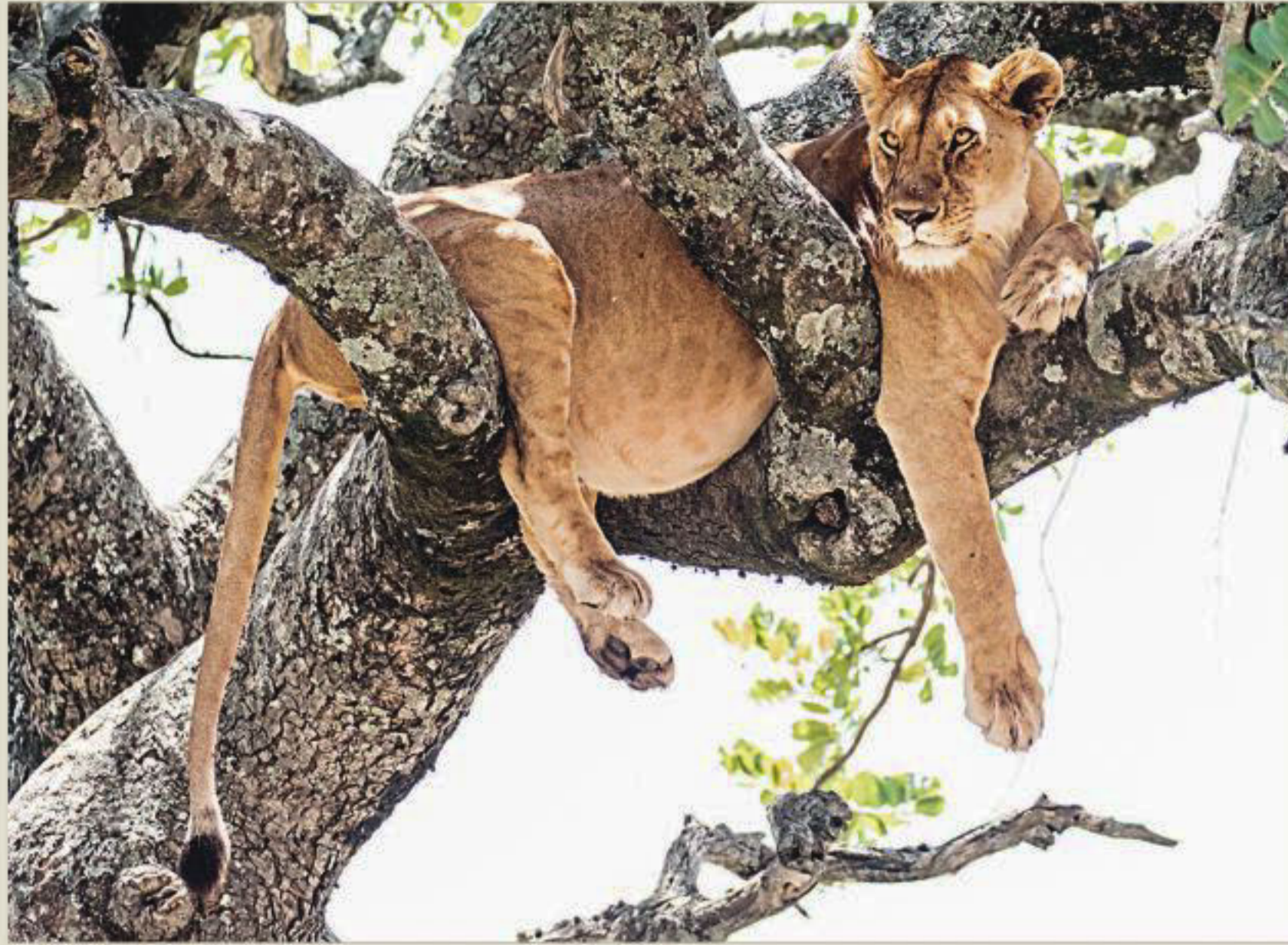
Lioness with full belly relaxes atop a tree.