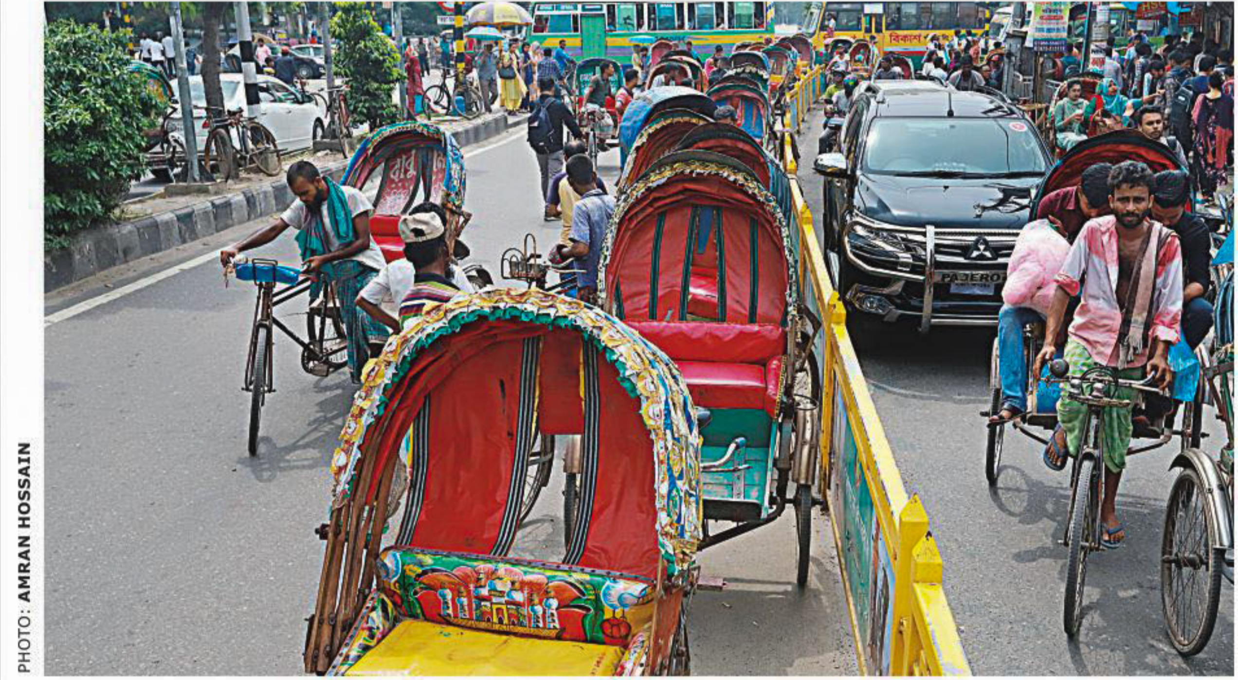
Despite there being a separate lane for rickshaws, many are seen parked on the other side of the divider, waiting for passengers -- clogging traffic movement. The photo was taken recently in the capital's Nilkhet.

The foreign tours would enrich the experience of our officials in implementation of the project successfully as the selected countries have had success with experience in preserving rainwater and dealing with other surface water for irrigation.