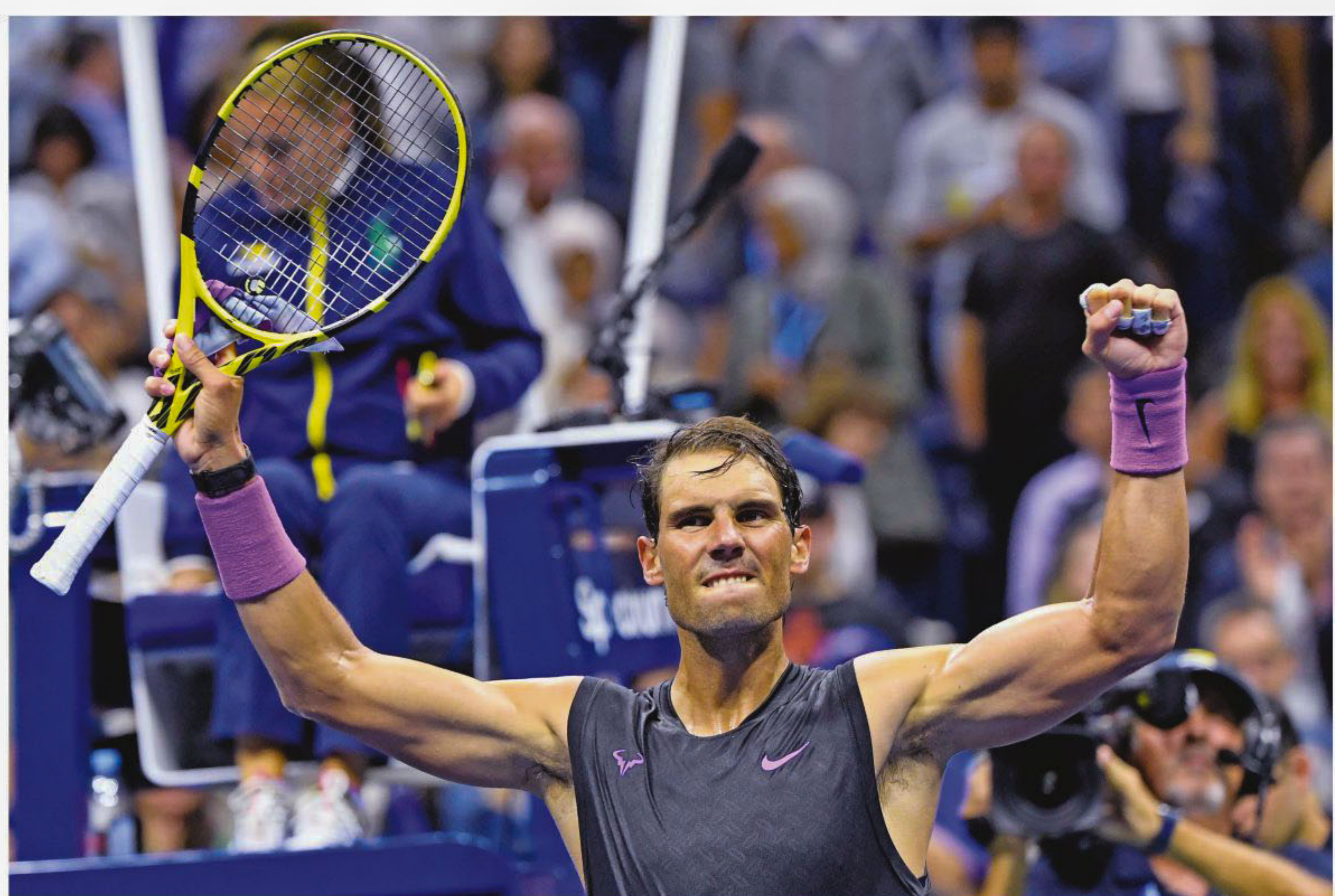
Rafael Nadal celebrates his straight sets victory against John Millman in the men's singles first round match of the US Open at Flushing Meadows in New York on Tuesday.