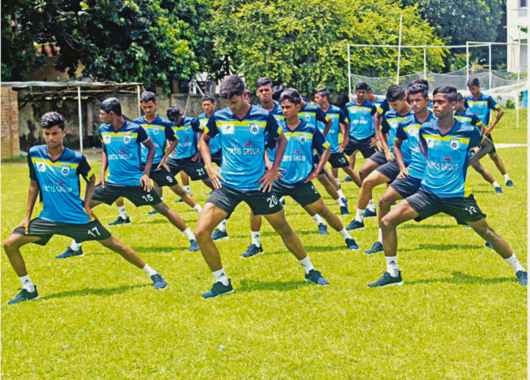
Bangladesh team train at Kalyani, West Bengal yesterday ahead of today's crucial SAFF U-15 Championship match against India.

be considered. India (+5) are on top in goal difference, followed by Nepal (-2) and Bangladesh (-3). If Bangladesh beat India by at least a two-goal margin, then Bangladesh will topple Nepal to book the final against India. In another equation, if Nepal lose to winless Bhutan, Bangladesh will be through to final with only a draw against India. However, beating India will not be easy for Bangladesh as India are in great form, having scored 17 goals in the three matches against Nepal [5-0], Bhutan [7-0] and Sri Lanka [5-0], keeping clean sheet in all three matches. However, Bangladesh can take inspiration from their previous four meetings, where Bangladesh won three times including two in tiebreaker and lost only once during the second edition of the tournament in 2013. Bangladesh beat India 4-2 in tiebreaker after the regulation time of the semifinal of last edition ended in a 1-1 draw. It was a repeat for Bangladesh of the 2015 edition final in Sylhet, which the hosts won. "If we want to play in the final, we don't have any alternative but to win over India. We have been preparing and designing our game plan in that way," Bangladesh coach Anwar Parvez Babu said yesterday.