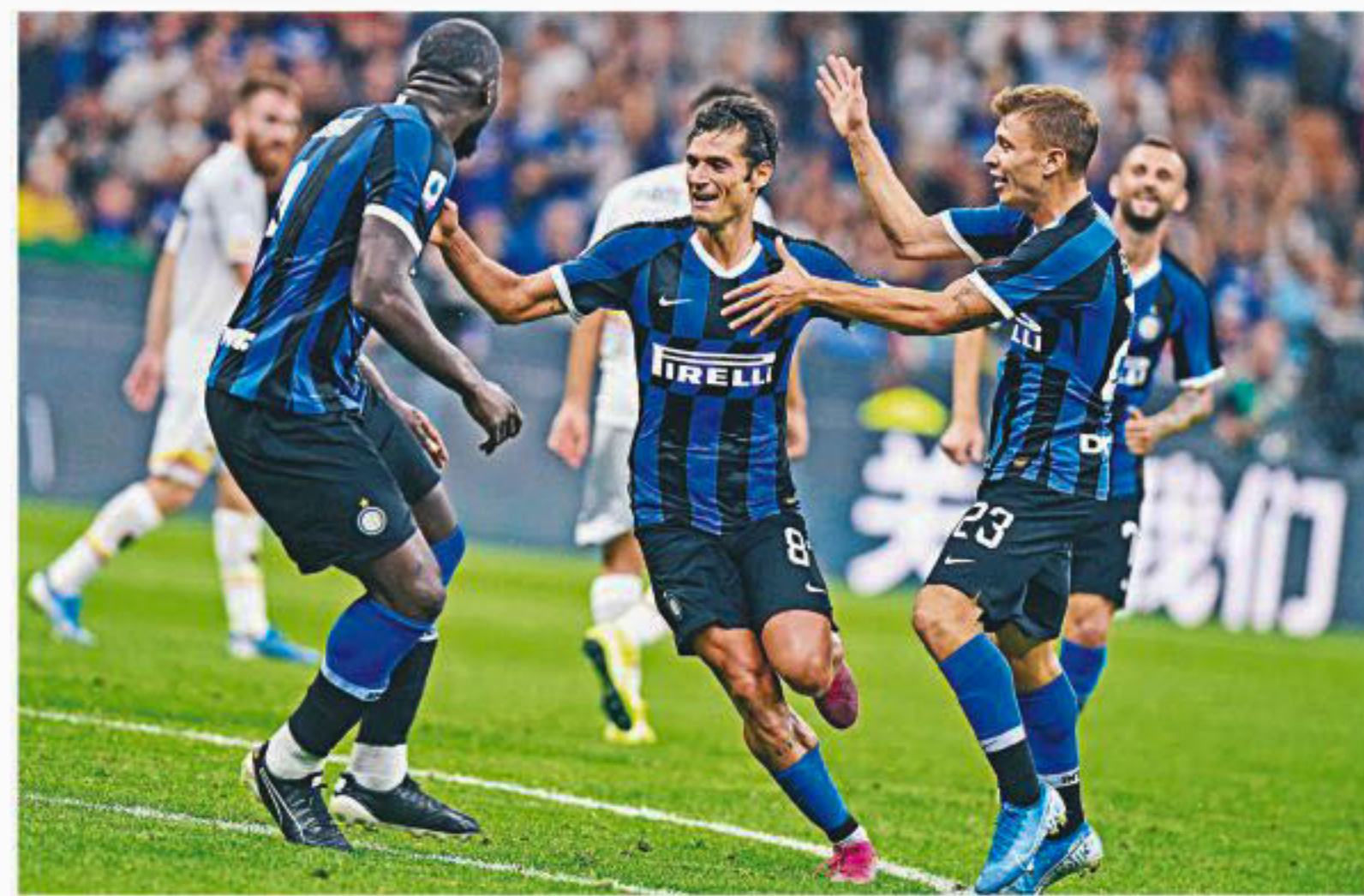
Inter Milan forward Antonio Candreva (C) celebrates his goal with teammates Romelu Lukaku (L) and Nicolò Barella during their Serie A clash against Lecce at the San Siro on Monday.

"The strategy will be similar. Maybe more caution and less risk because we have a slight advantage going into this match. We still believe we cannot just defend; we also need to attack and create chances through counter attacks and hopefully get a goal. The attitude of the players must be the same. We are just one step away from the final," the Portuguese coach added.