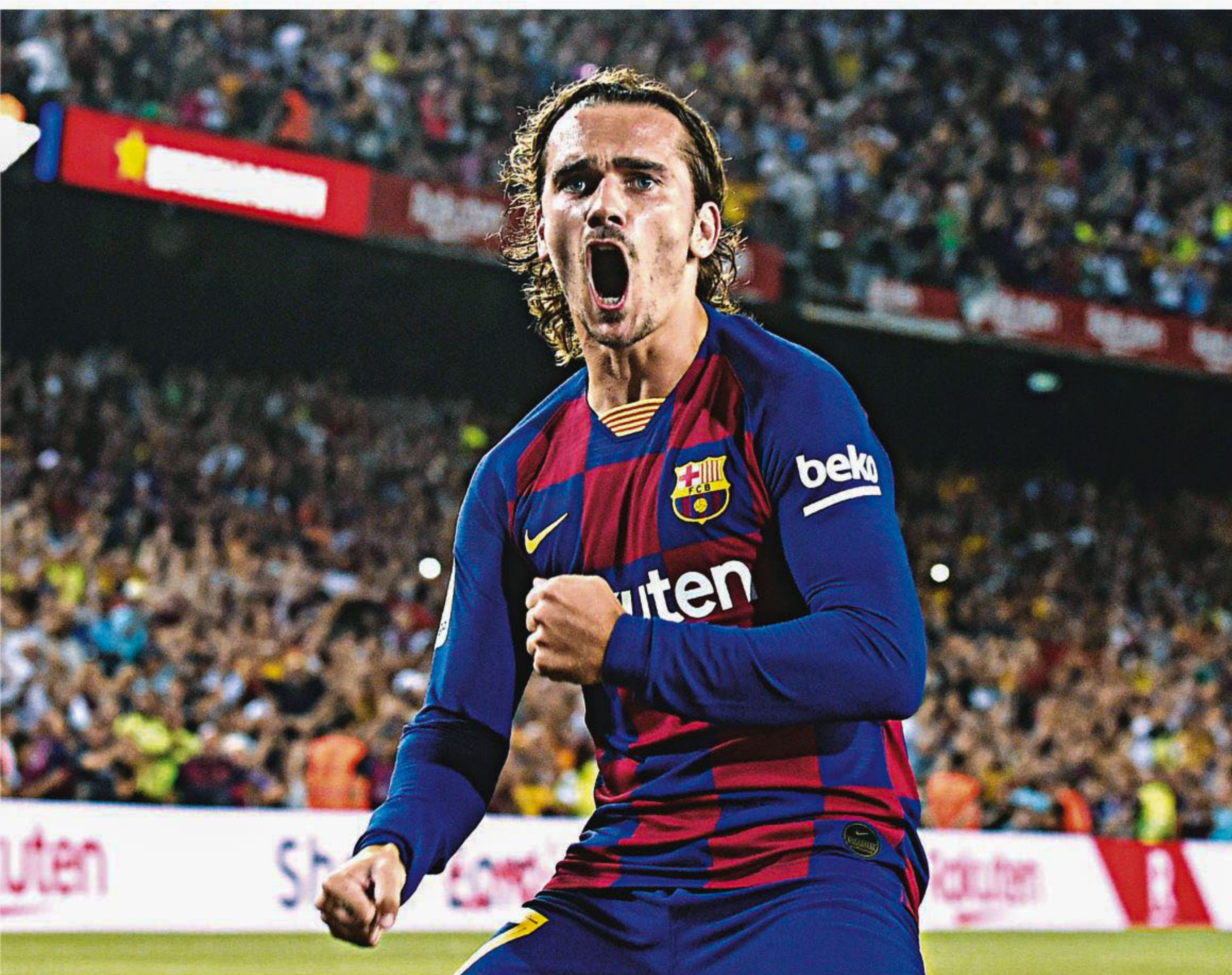
Barcelona striker Antoine Griezmann is ecstatic after scoring his second goal against Real Betis during their La Liga encounter at the Nou Camp on Sunday.

The under-18 tournament with participation of youth sides of Bangladesh Premier League clubs will be held from September 12, the meeting also decided.