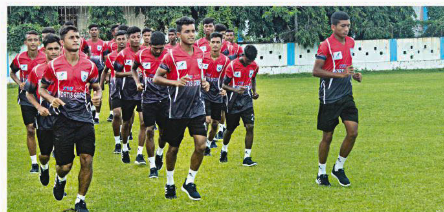
Bangladesh team undergo a drill session in Kalyani, West Bengal yesterday ahead of today's match of the SAFF U-15 Championship against Nepal.