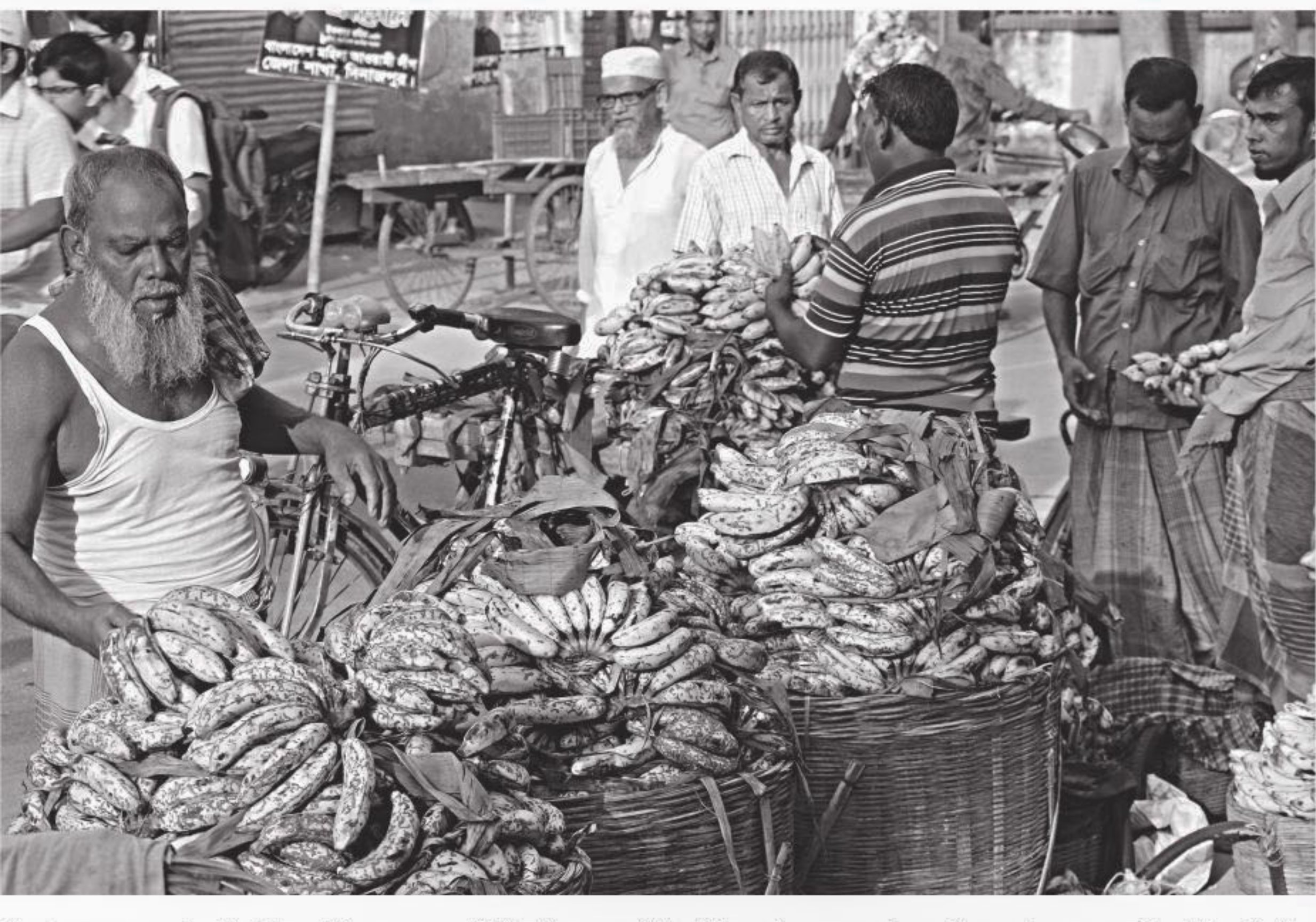
The banana market in Munshipara area of Dinajpur municipality gets momentum. It sees huge supply of the fruit and farmers are getting fair prices as well. The photo was taken on Sunday.