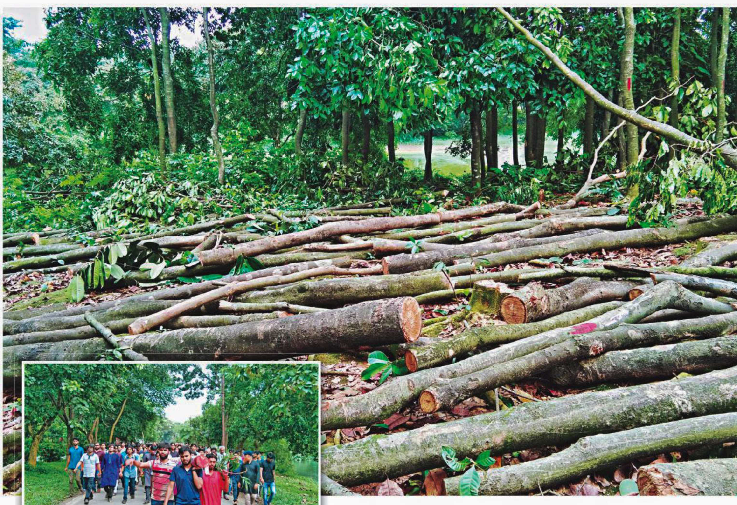
Felled trees on the proposed site of a student dormitory on the Jahangirnagar University campus. Inset, JU students bring out a procession protesting the felling of trees and "unplanned development" on the campus. The photos were taken on Friday.