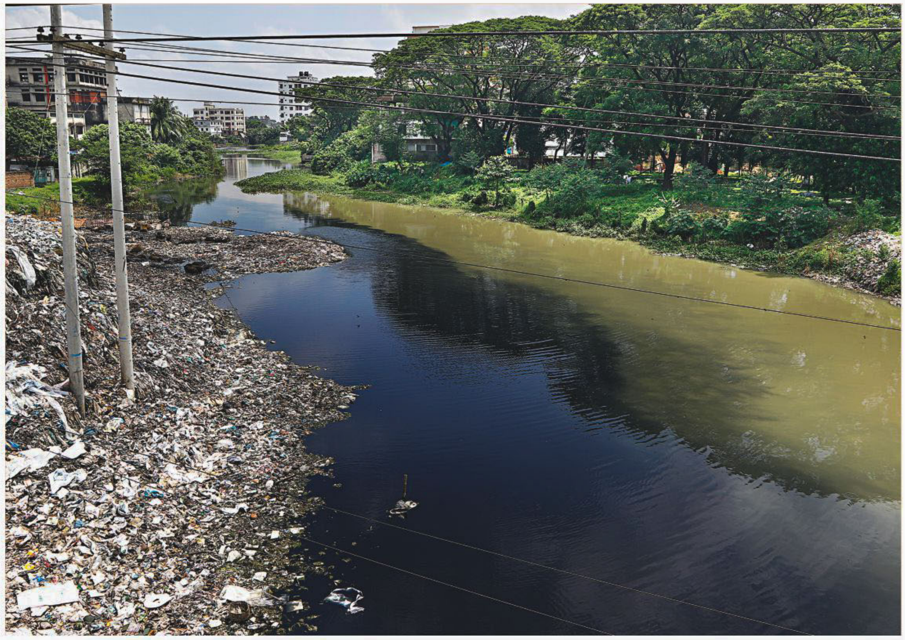
Part of Karnapara Khal in Savar on the outskirts of the capital has turned pitch black due to discharge of waste water from nearby factories and dumping of garbage by locals. The photo was taken on Sunday.