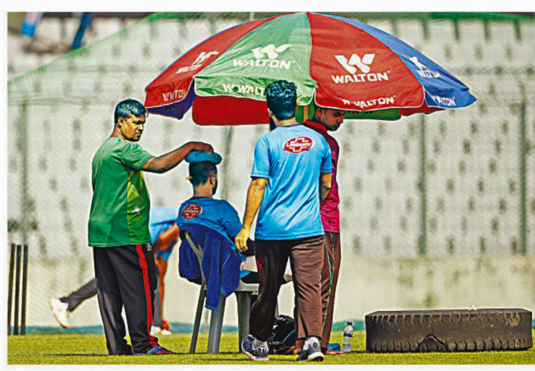
SHAKIB CATCHES HEAT: The sweltering afternoon heat got the better of none other than Test skipper Shakib Al Hasan, who resorted to applying an ice bag on top of his head during a practice session at Mirpur yesterday.

Steve Smith is set to make his return to action in a tour match against Derbyshire after the Australia star batted against bowlers for the first time on Sunday since being concussed. Smith, one of the world's leading batsmen, was ruled out of the ongoing third Ashes Test at Headingley with concussion after being hit by a 92 mph bouncer from England fast bowler Jofra Archer in the drawn second match at Lord's.