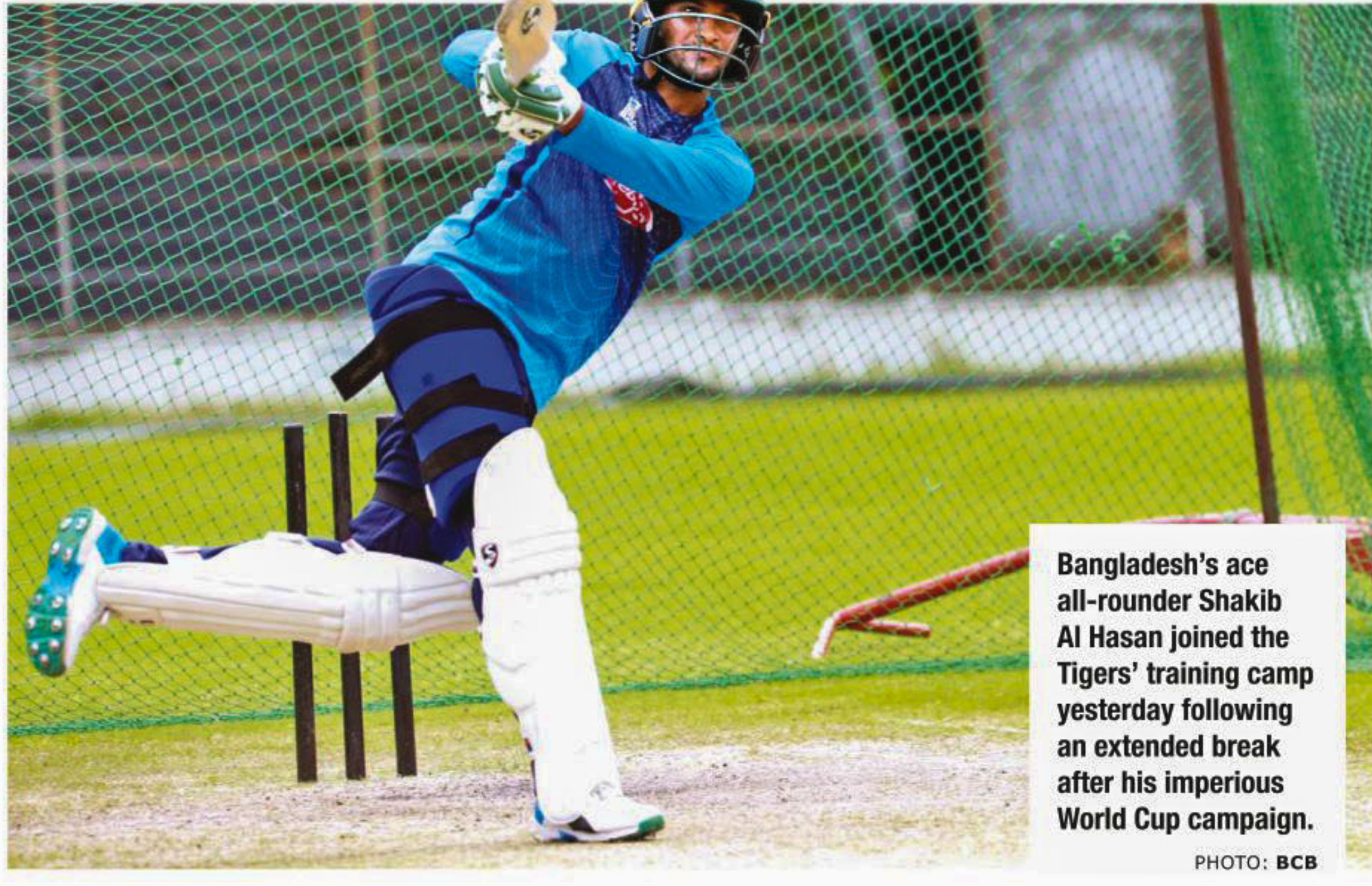
Bangladesh's ace all-rounder Shakib Al Hasan joined the Tigers' training camp yesterday following an extended break after his imperious World Cup campaign.