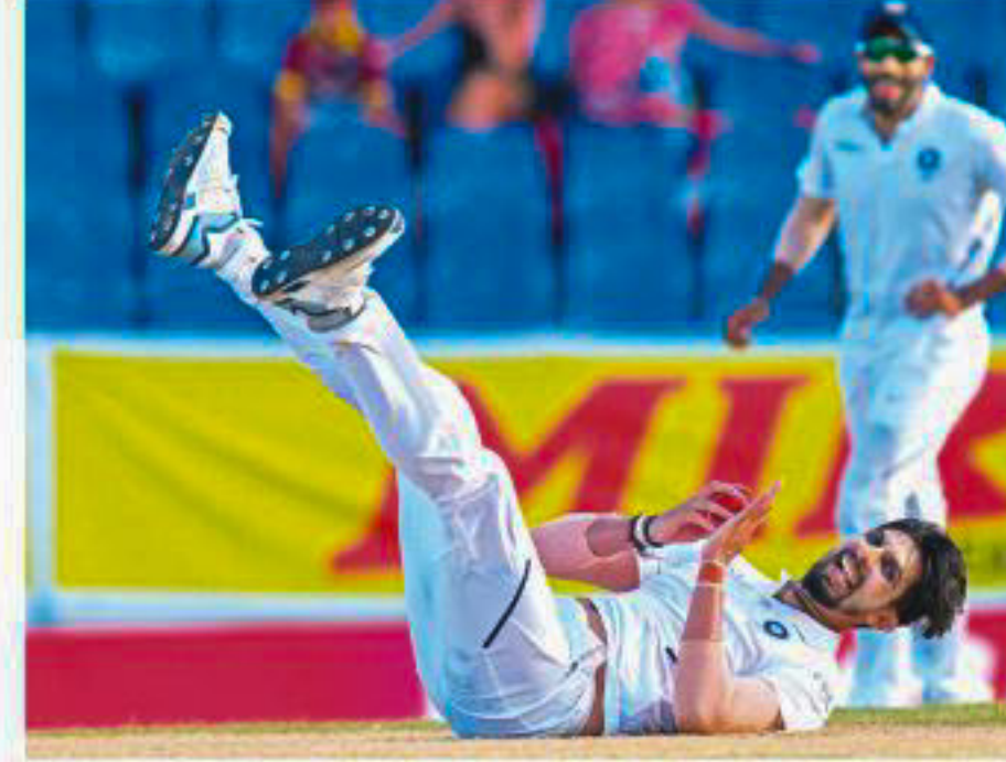
India's Ishant Sharma happily completes a catch on the second day of the first Test against West Indies.

Agarwal was ruled leg-before although television replays showed the decision would have been overturned has it been