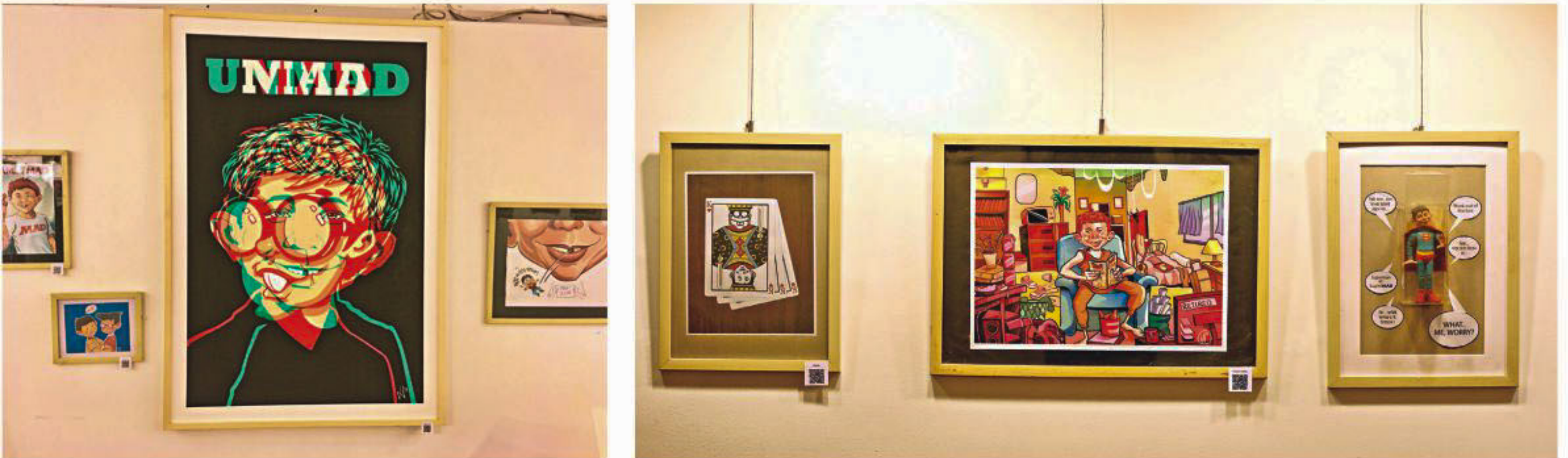
Among other things, the exhibition comprises of double exposure art, hand-sketched and digital cartoons, glass paintings and figurines.