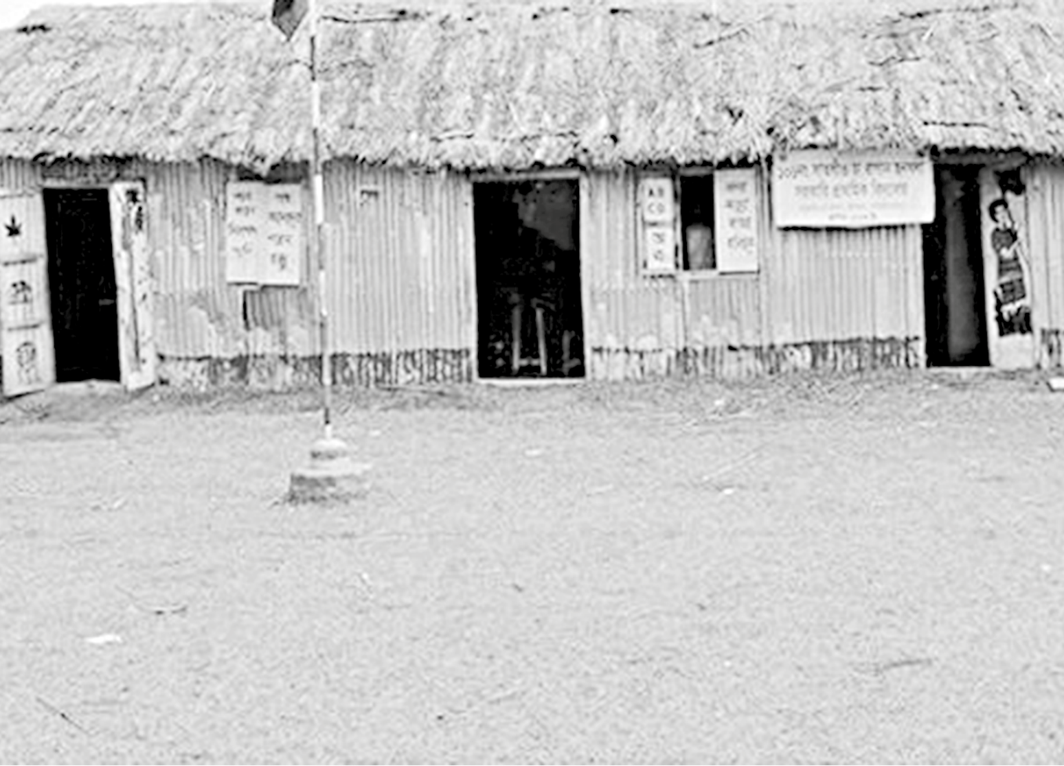
The risky thatched house of Satgaon Cha Bagan Chankhala Government Primary School in Srimangal upazila of Moulvibazar.