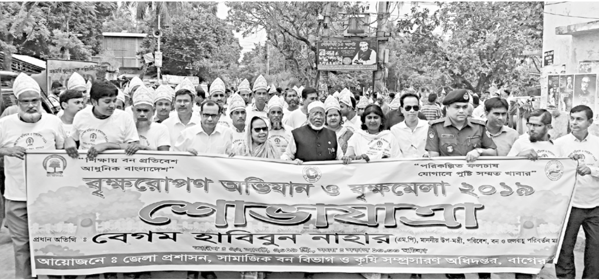
The Bagerhat district administration in cooperation with the departments of social forestation and agricultural extension brings out a procession in the town yesterday marking week-long Tree Plantation Campaign and Tree Fair 2019. Begum Habibun Nahar, deputy minister for environment, forests and climate change, inaugurated the programme at Swadhinata Udyan in the town.