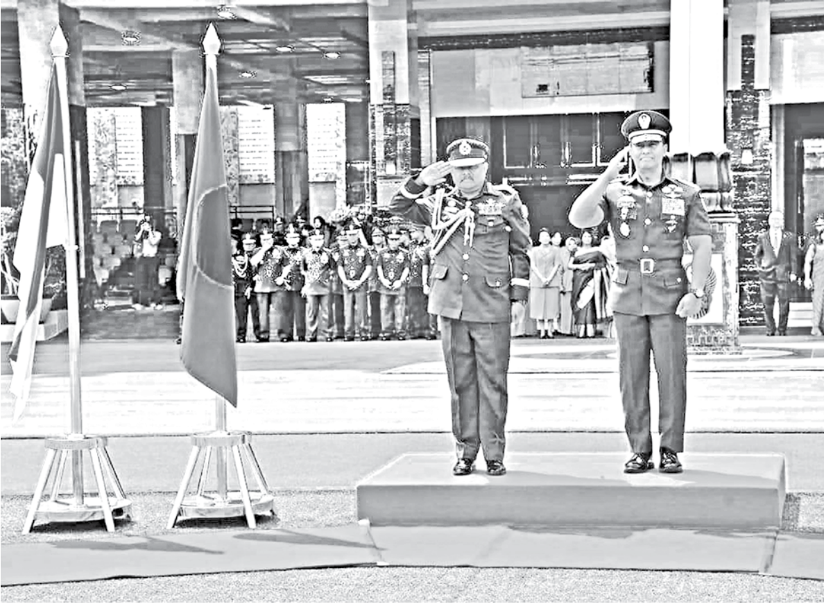
The Indonesian Army offers a guard of honour to Bangladesh Army Chief General Aziz Ahmed, after he reached the country on Tuesday. The general received a tour of the army headquarters, and the two parties discussed several issues, including peacekeeping and controlling crime.

practice. Terming it one of the major reasons for fatalities, he said will take all necessary measures to stop travelling on train roof. He said there will be an exclusive meeting on the matter on August 25 at Rail Bhavan, which will be attended by officials of all departments concerned.