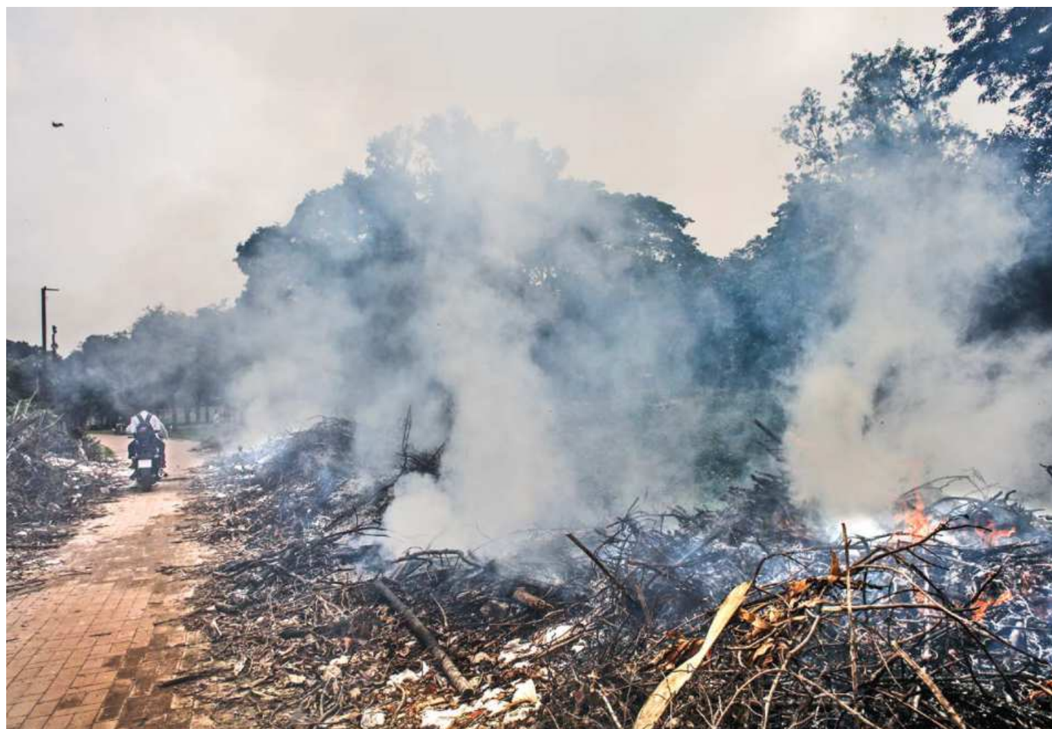
A part of the Suhrawardy Udyan shrouded in smoke of burning twigs and litter yesterday. The thick smoke has a strong smell and causes burning eyes.