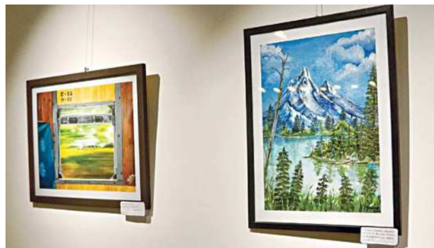
The artworks at the exhibition.