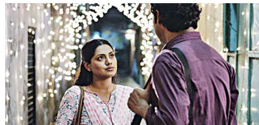
A still from 'Iti, Tomari Dhaka'.

With eleven exceptionally promising young directors from Bangladesh, Impress Telefilm's Iti, Tomari Dhaka is an assortment of shorts, with Dhaka as its central theme. The film was last shown at the Durban International Film Festival last month.