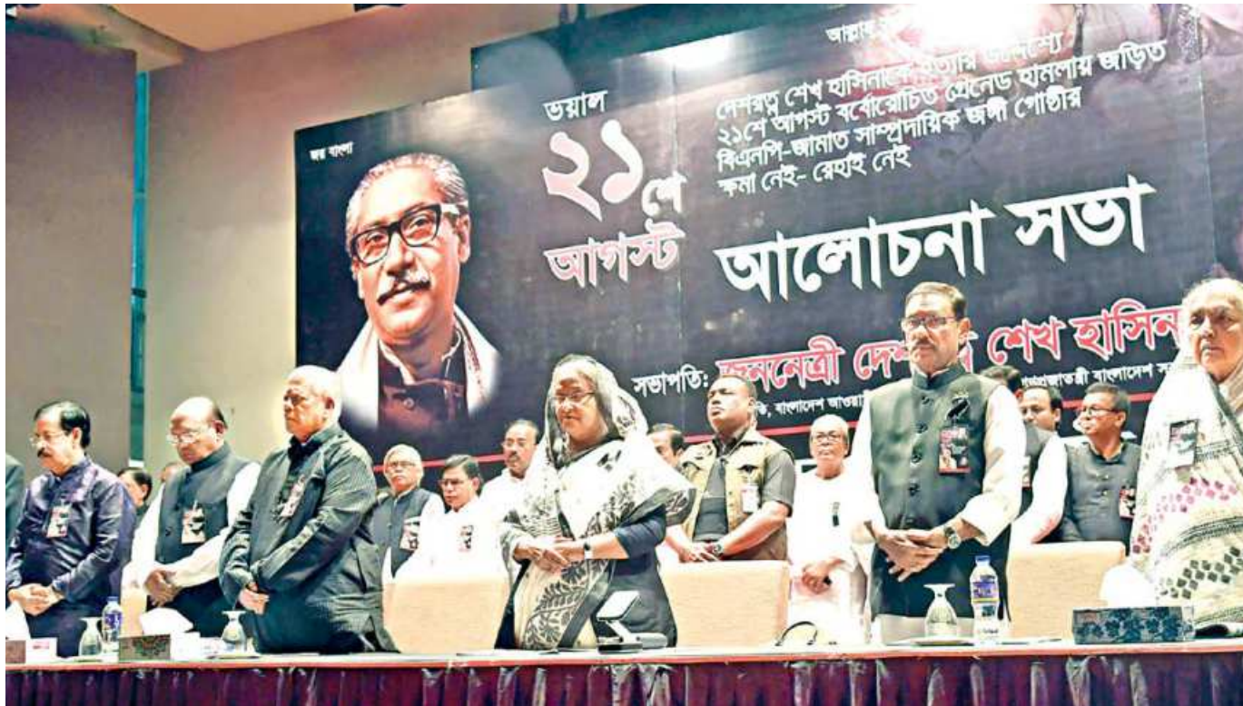
Flanked by senior Awami League leaders, Prime Ministers Sheikh Hasina stands on stage for a moment of silence to remember those who perished in the August 21, 2004, grenade attack on an AL rally on Bangabandhu Avenue. The photo was taken at a discussion programme held at the Krishibid Institution Bangladesh yesterday.