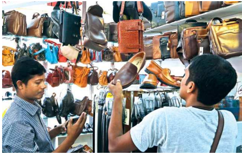
Exports of leather goods rose due to higher shipments to non-traditional markets and the US-China trade war.