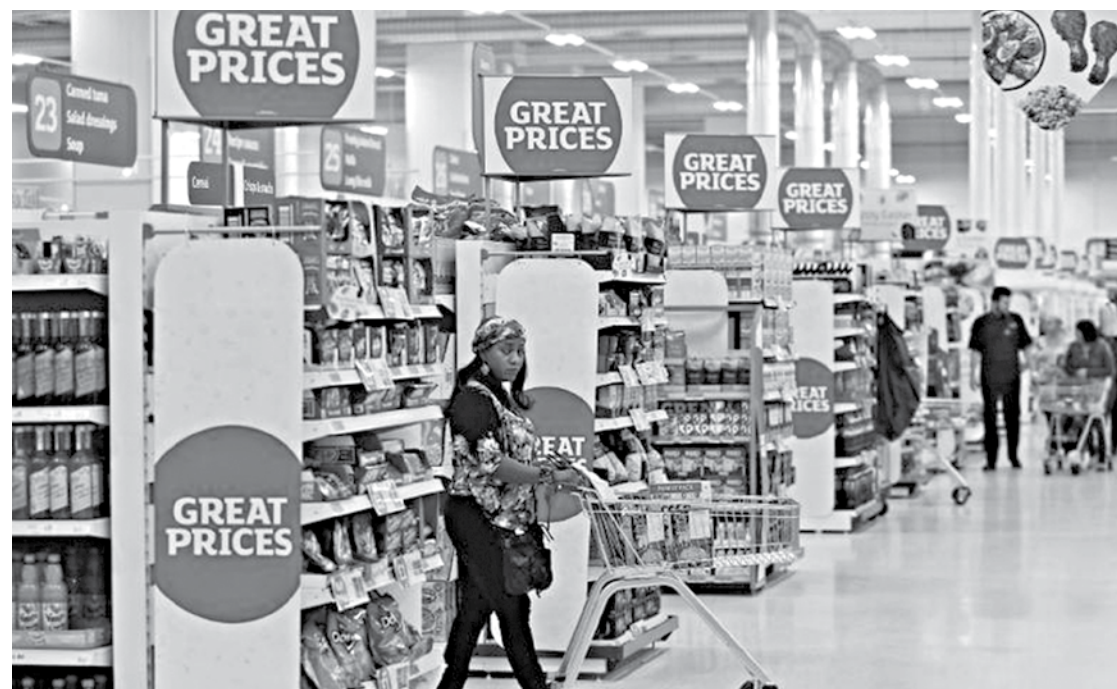
A shopper pushes a trolley in a supermarket in London.

"It comes like that and my wife is hungry. It's up to the supermarket to (make the switch) as opposed to us, isn't it?"