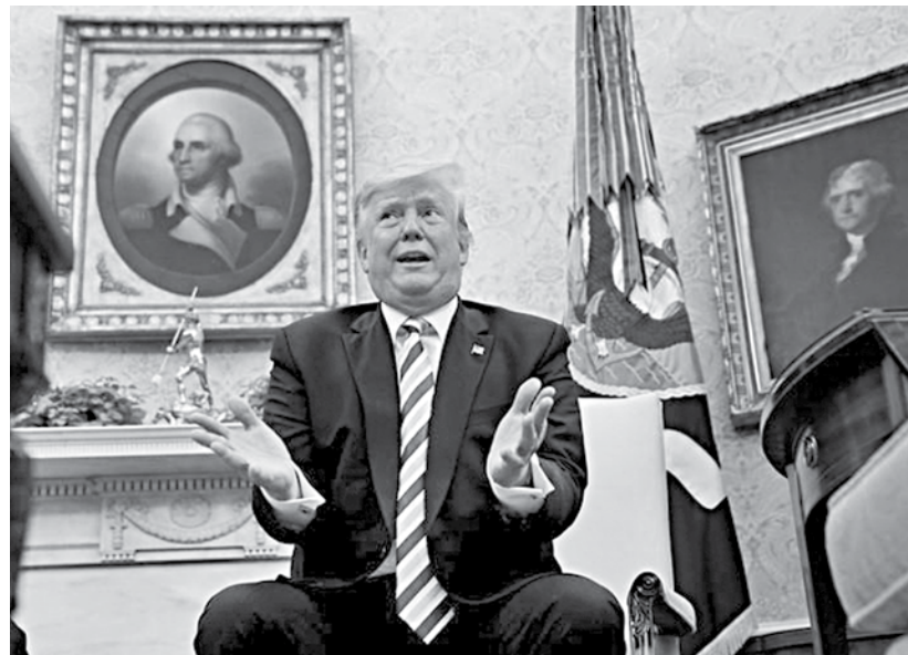
US President Donald Trump answers questions from reporters as he meets with Romania's President Klaus Iohannis in the Oval Office in Washington on August 20.

Prime Minister Narendra Modi has been working to push electric vehicles in an effort to cut India's fuel import bill and curb pollution. In June, a government think-tank that plays a key role in policymaking had recommended that only electric models of scooters and motorbikes with engine capacity of more than 150cc must be sold from 2025.