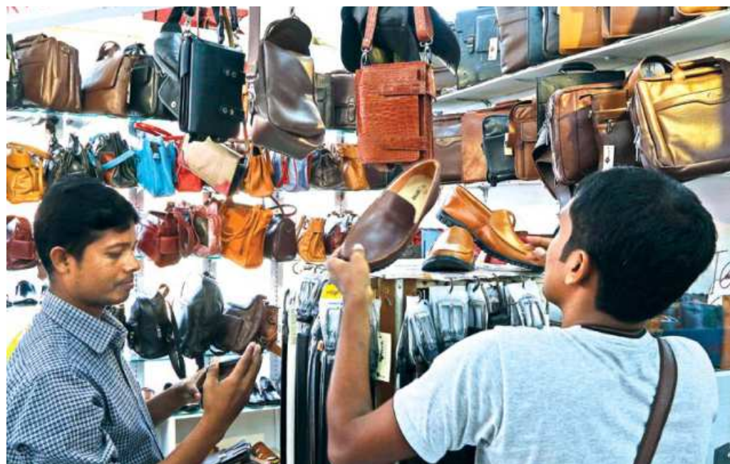
Exports of leather goods rose due to higher shipments to non-traditional markets and the US-China trade war.