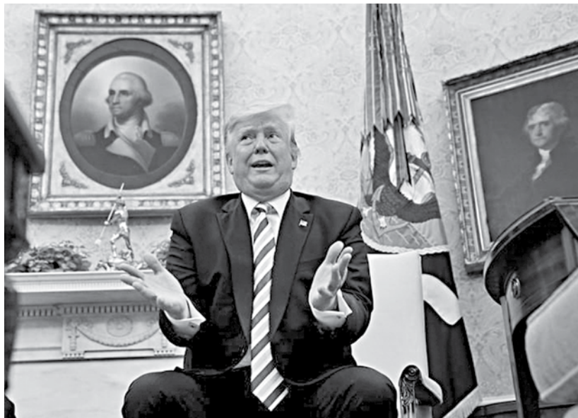
US President Donald Trump answers questions from reporters as he meets with Romania's President Klaus Iohannis in the Oval Office in Washington on August 20.

2-year Treasury bonds than for 10-year Treasury bonds, a potential signal of lost faith in near-term economic growth. Trump dismissed fears of a slowdown, extolling low unemployment and a rising stock market over his tenure. "I think the word 'recession' is a word that's inappropriate...We're very far from a recession," he said. The Washington Post reported a temporary payroll tax cut was under consideration to juice growth, but Trump said the White House has been weighing tax cuts for some time. A slowdown would be bad news for Trump, who is building his 2020