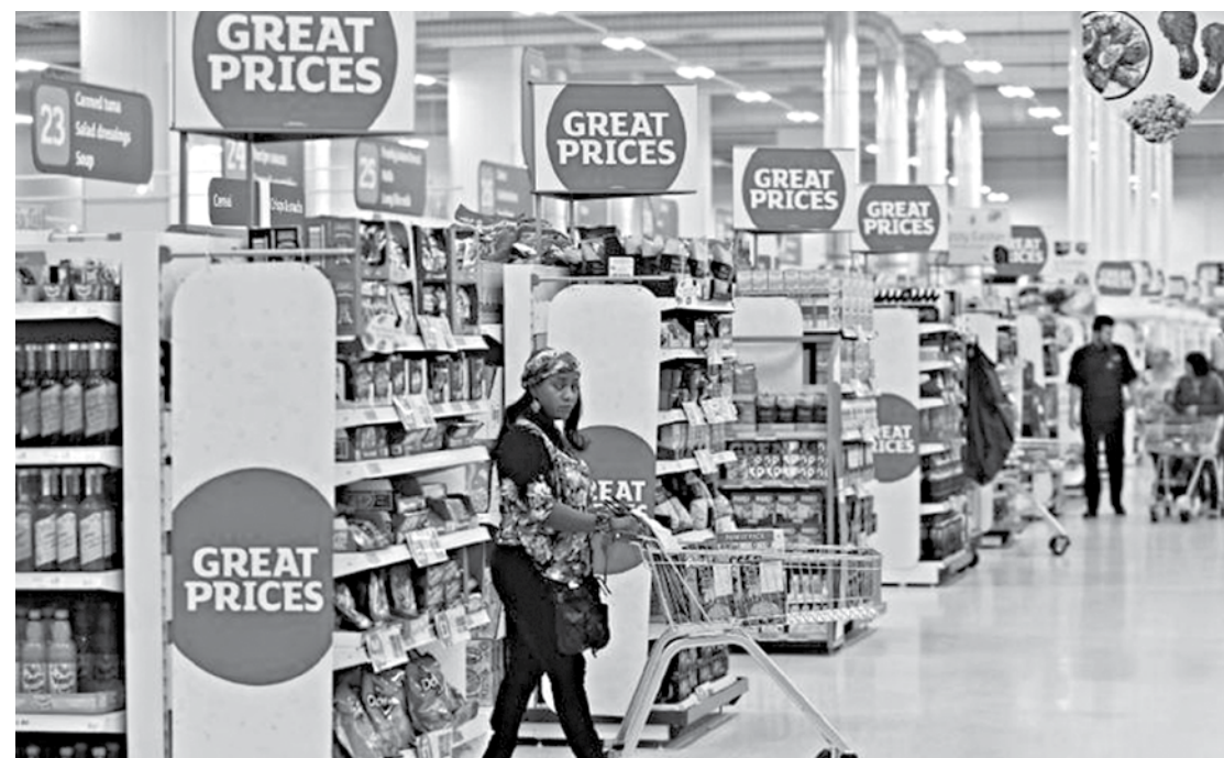
A shopper pushes a trolley in a supermarket in London.