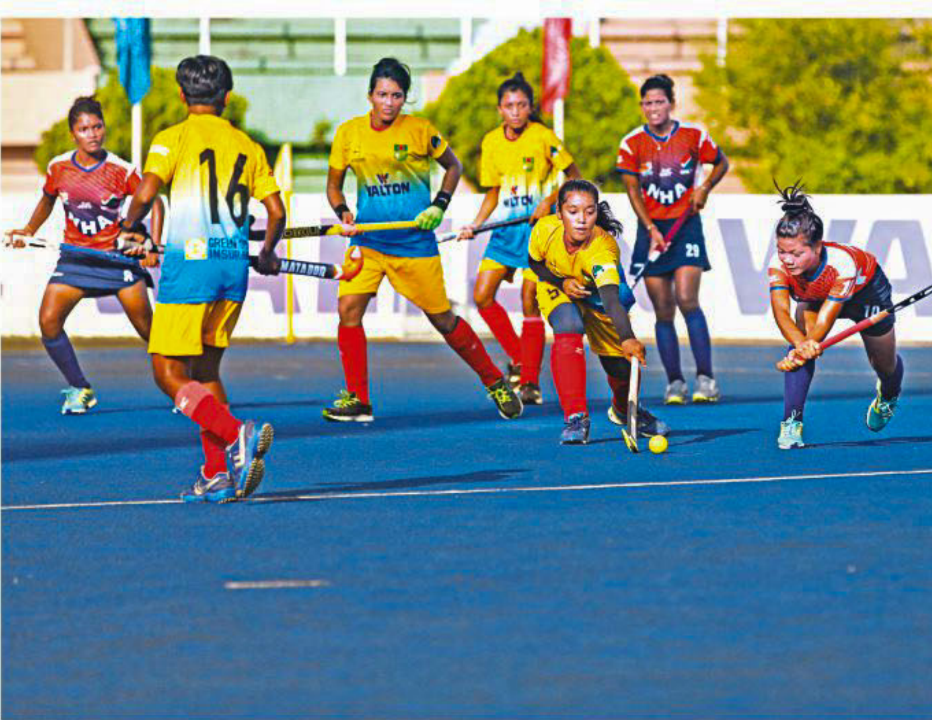
Bangladesh Under-21 women hockey players vie against an Indian academy side in the first match of a six-match series at the Maulana Bhasani Hockey Stadium yesterday.

The second match will be played tomorrow.