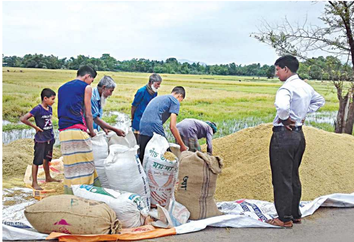
Some farmers stuffing paddy into sacks to sell it to middlemen in a haor area of Sunamganj's Bishwambhapur upazila recently. These middlemen are using farmer cards to supply paddy to the local food office, depriving the marginalised growers in the haor area of fair prices for their produce.