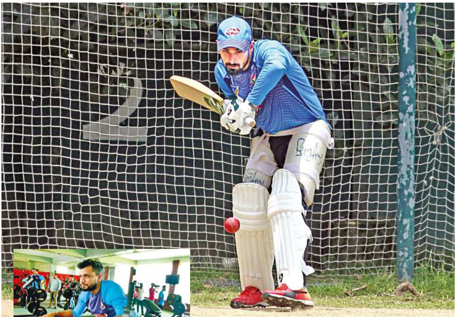
Even though the day was meant for fitness training and observation, certain cricketers such as Liton Das elected to jump-start their skill practice as the wicketkeeper-batsman was hard at work in the nets on the first of a four-day conditioning camp in Mirpur yesterday. (Inset) Mashrafe Bin Mortaza was also present, toiling away to keep his fitness levels up.