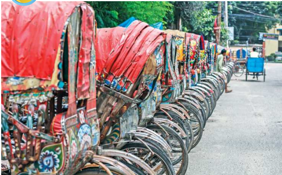
A LINGERING EID VACATION ... Although Dhaka streets seem to be returning to their full chaotic glory following a quaint week of Eid, this long queue of locked-up rickshaws on the roadside in Tejgaon hints that not all rickshaw-pullers have come back to the megacity. The photo was taken yesterday morning.