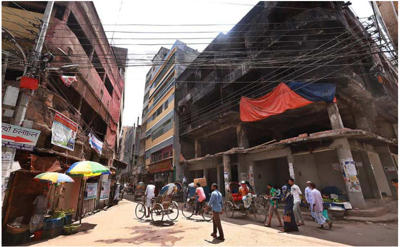
This once-bustling intersection in Churihatta has become uncharacteristically deserted for Old Dhaka, as locals live with the trauma of the horrific fire, and in fear that the charred remains of Wahed Mansion may crumble on them. The photo was taken yesterday.

Fire hazard in Old Dhaka remains unchanged 6 months after Chawkbazar blaze; victims yet to receive financial help