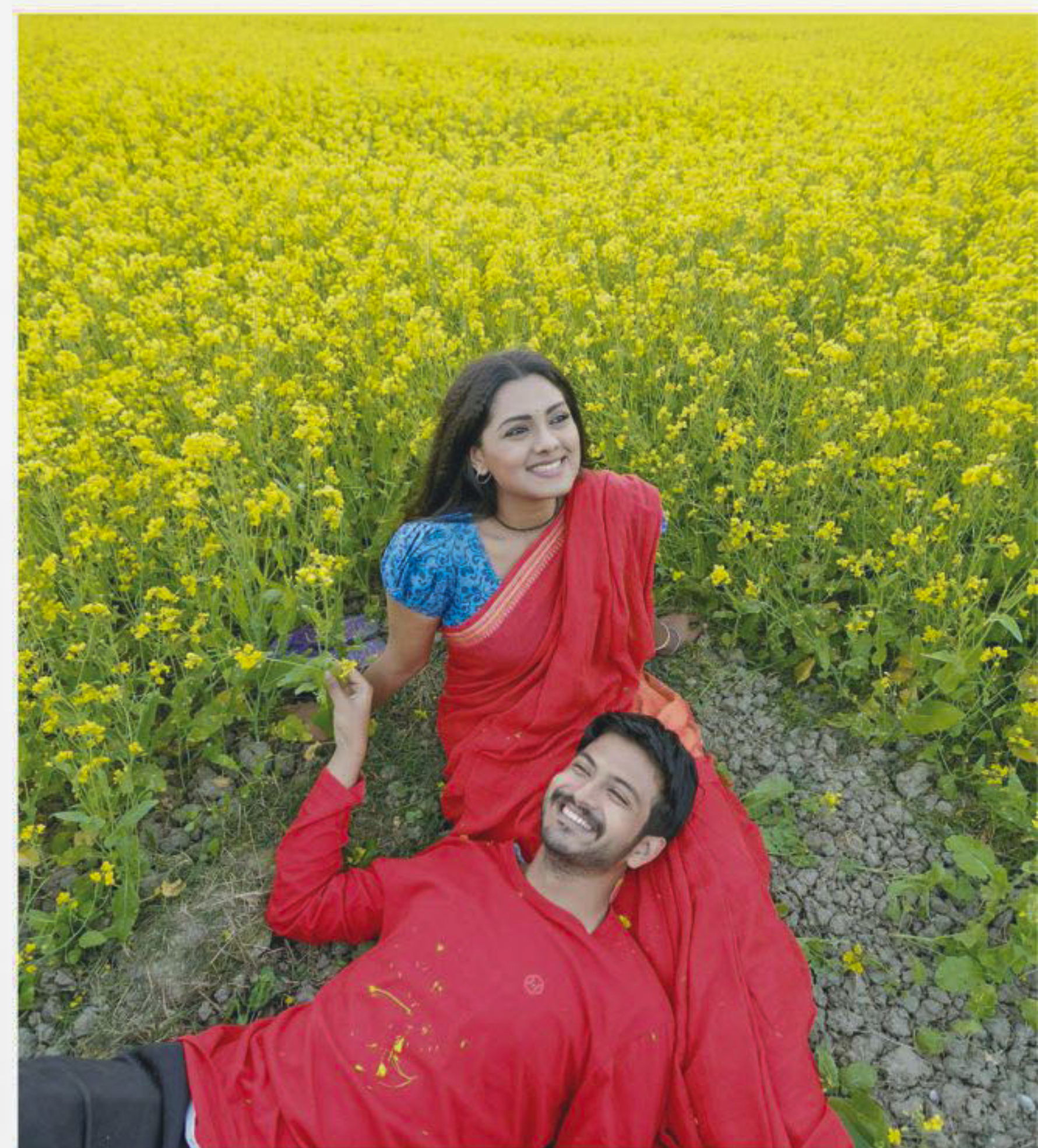
A still from 'Mayaboti', starring Nusrat Imrose Tisha and Yash Rohan.