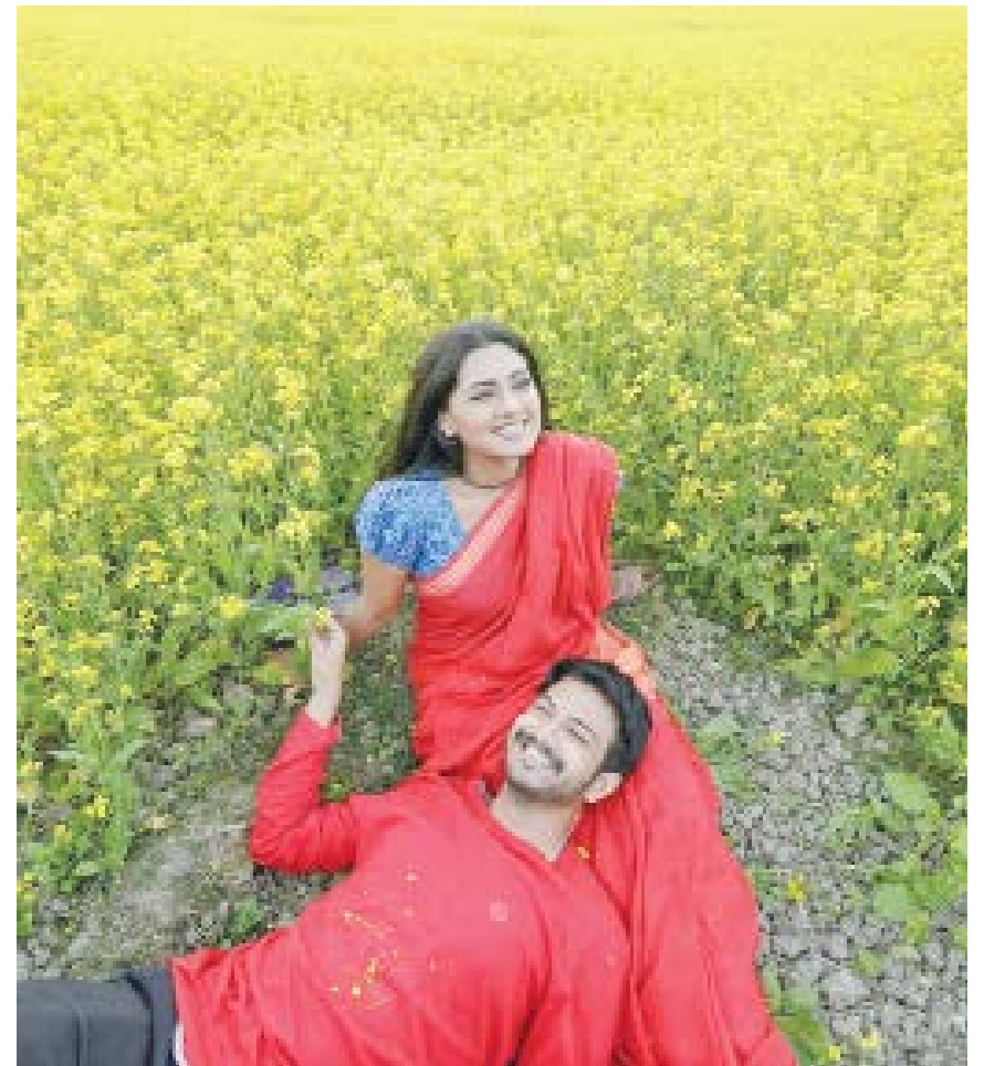
A still from 'Mayaboti', starring Nusrat Imrose Tisha and Yash Rohan.