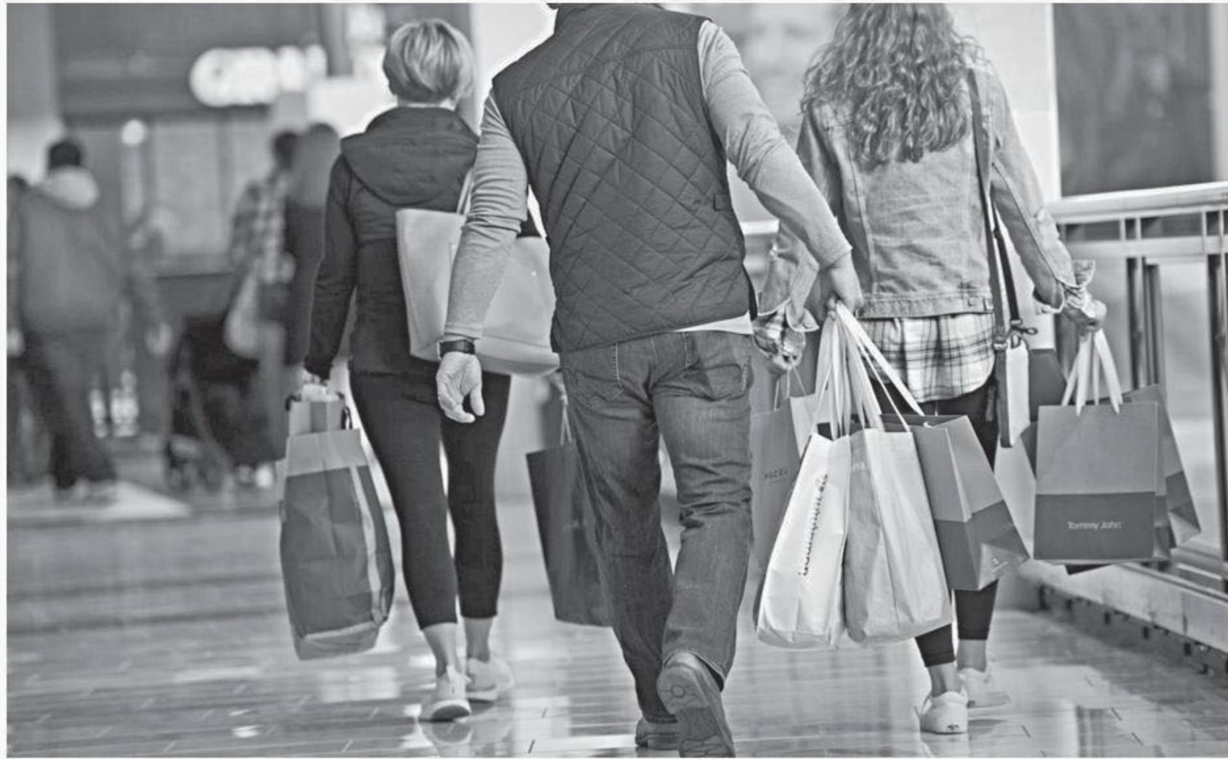
Shoppers carry bags of purchased merchandise at shopping mall in Pennsylvania, US.

Even before Trump gave retailers an early Christmas bonus by delaying tariffs on more than half the $300 billion in Chinese goods targeted for new 10 percent punitive duties, Americans' spending habits were buoying the economy. That trend continued in July, the first month of the third quarter, as retail sales jumped 0.7 percent, far