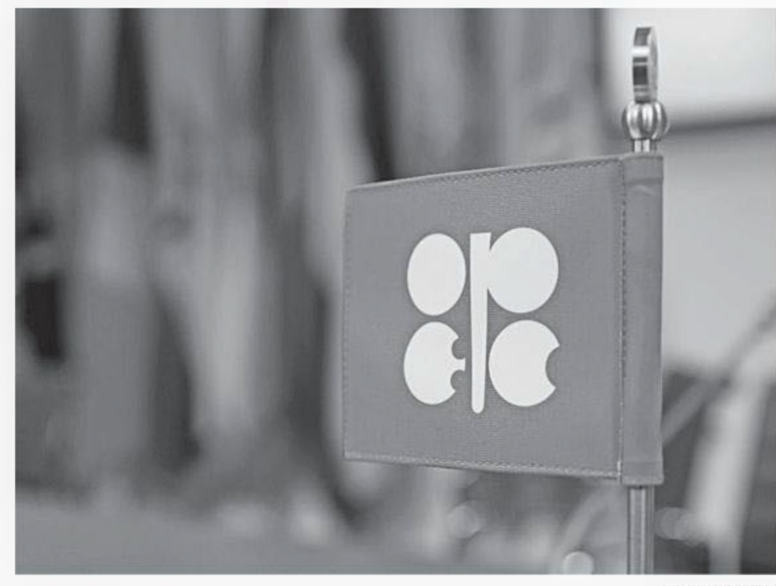
The logo of the Organization of the Petroleum Exporting Countries is seen inside its headquarters in Vienna, Austria.

The report suggests there will be a 2020 supply surplus of 200,000 bpd if Opec keeps pumping at July's rate and other things remain equal. Last month's report had implied a larger surplus of over 500,000 bpd.