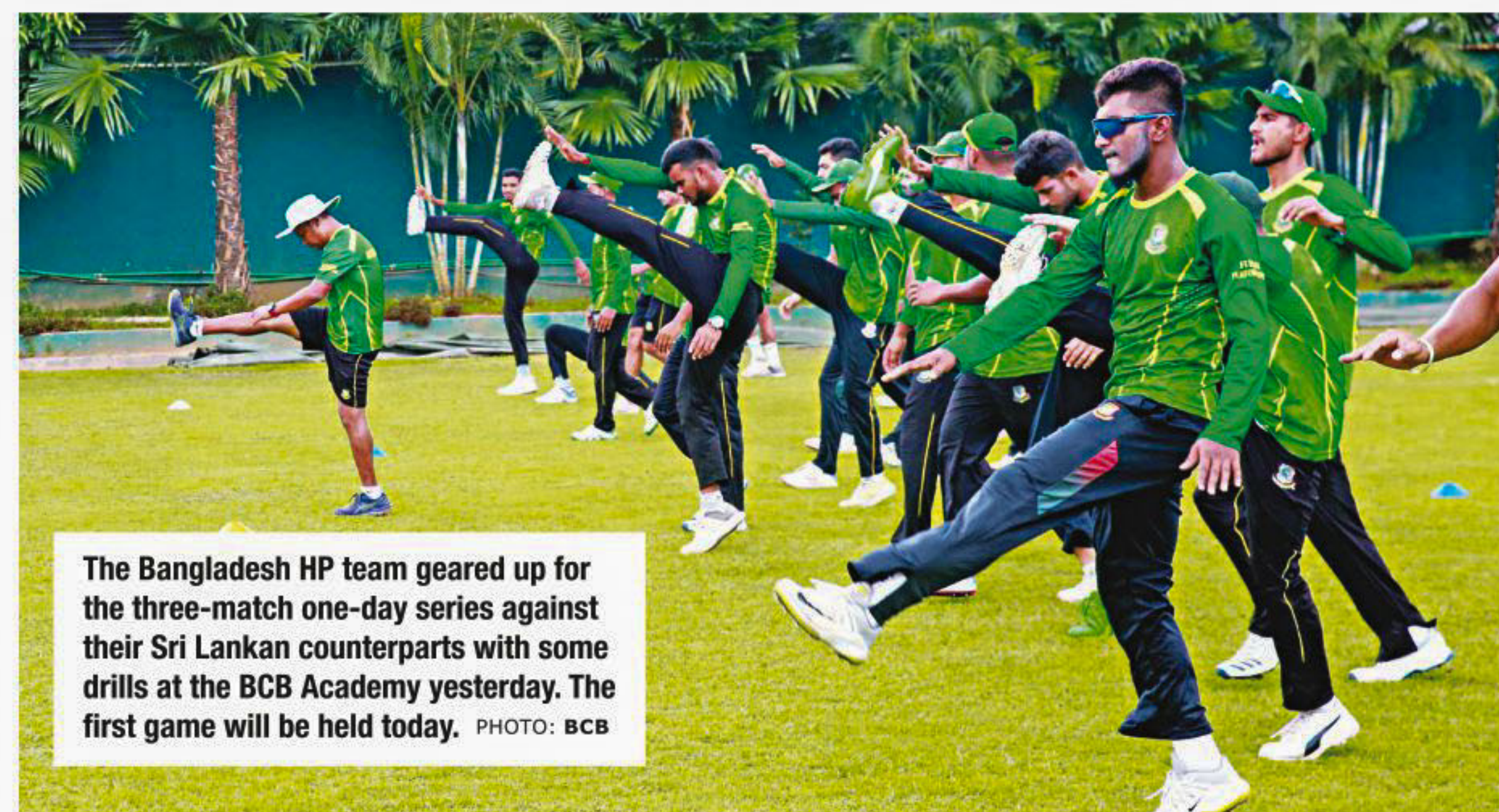
The Bangladesh HP team geared up for the three-match one-day series against their Sri Lankan counterparts with some drills at the BCB Academy yesterday. The first game will be held today.