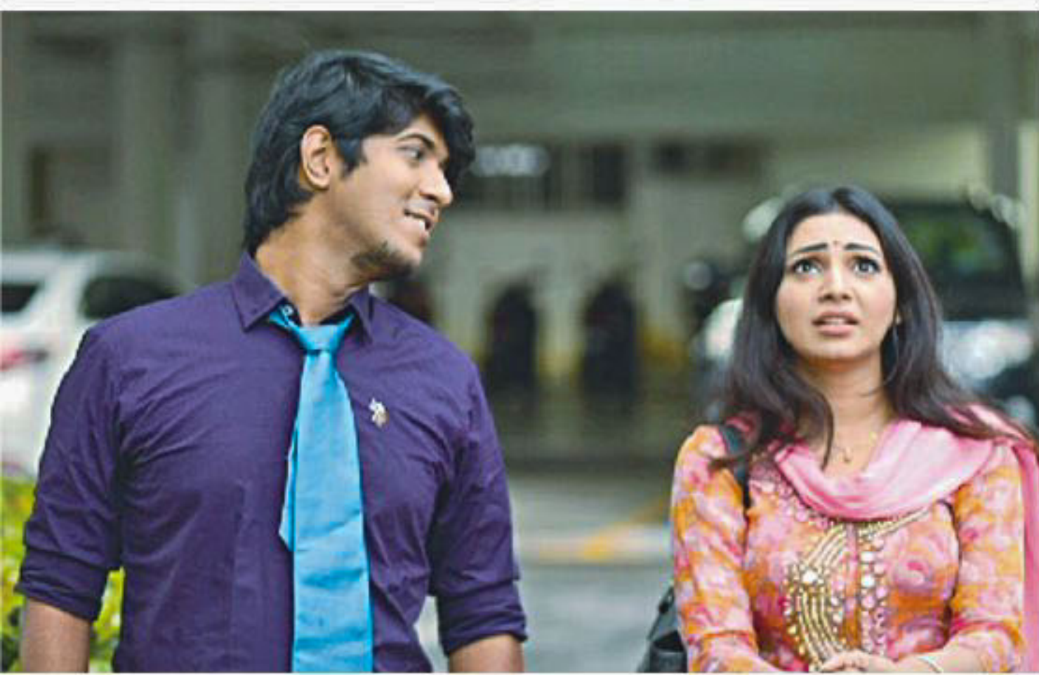
Flat Number 23