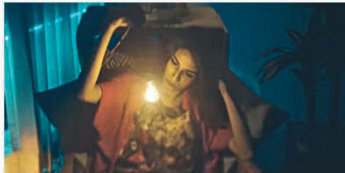
From the music video of 'Miththa' by Indalo.