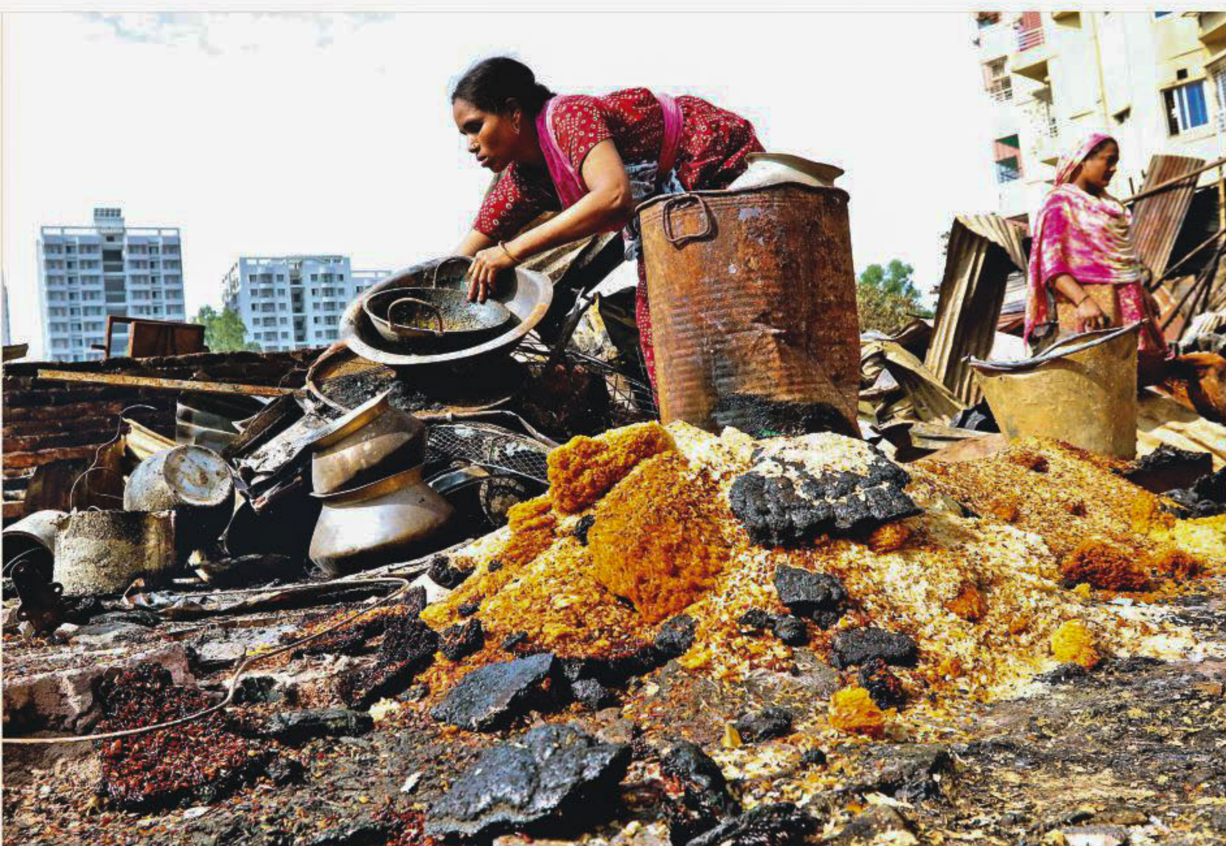
PICKING UP PIECES... As far as eyes could see, everything was burnt with thousands becoming homeless overnight. Friday night's fire at this slum in Mirpur's Chalantika area razed more than a thousand shanties to ashes. Yesterday, amid charred remains and rising smoke, residents, mostly low-wage earners, tried to salvage whatever they could. Children held on to utensils, women threw away burnt food and collected pots and pans while men recovered metal frames -- anything that could be used again.