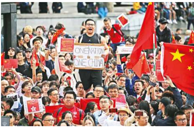
(From left, clockwise) Anti-government protesters attend a rally in the Hung Hom district of Hong Kong yesterday; a pro-Beijing supporter displays a China national flag sticker on her face as she takes part in a pro-government rally at Tamar Park; and pro-government protesters gather in central London to denounce violence caused by pro-democracy protesters in Hong Kong.