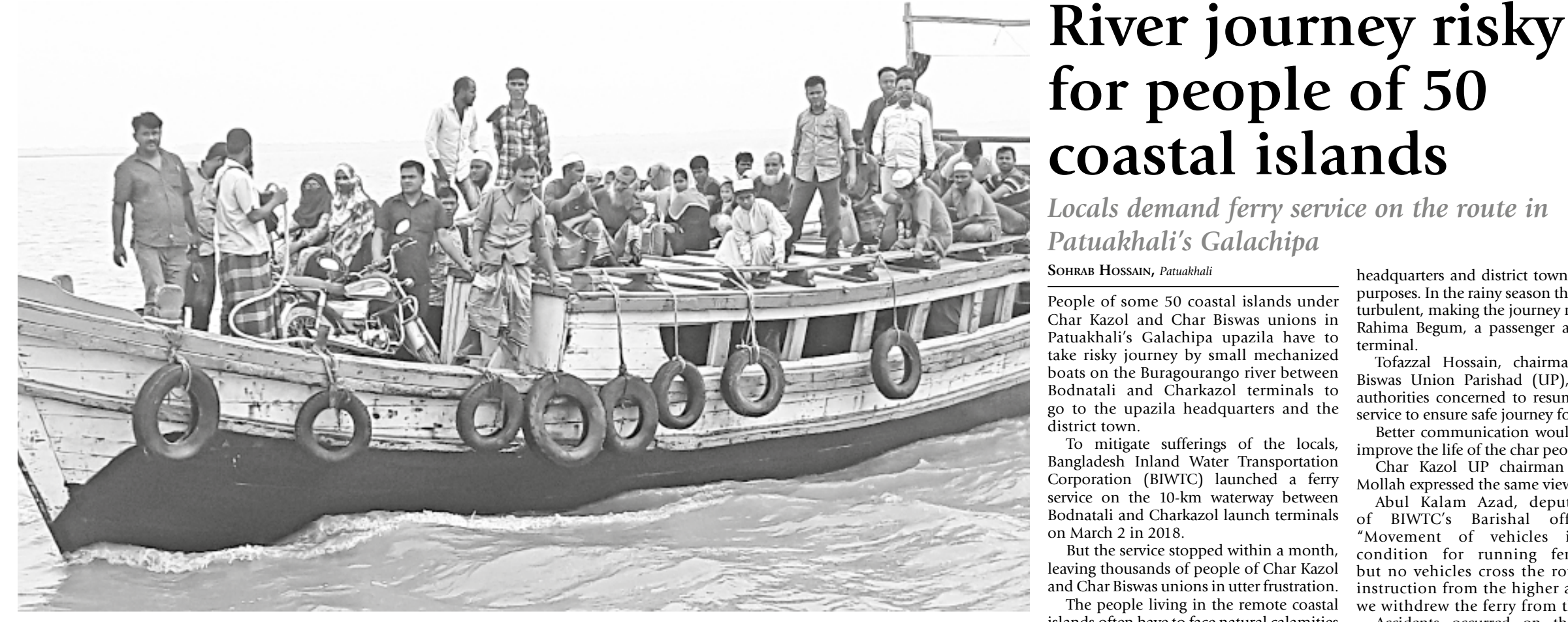
Small engine-run boats like this one carry passengers across the mighty Buragourango river in Galachipa upazila of Patuakhali as people of some 50 coastal islands in Char Kazal and Char Biswas unions under the upazila have to take the risky journey even during the ongoing monsoon to go to different destinations including upazila and district headquarters.