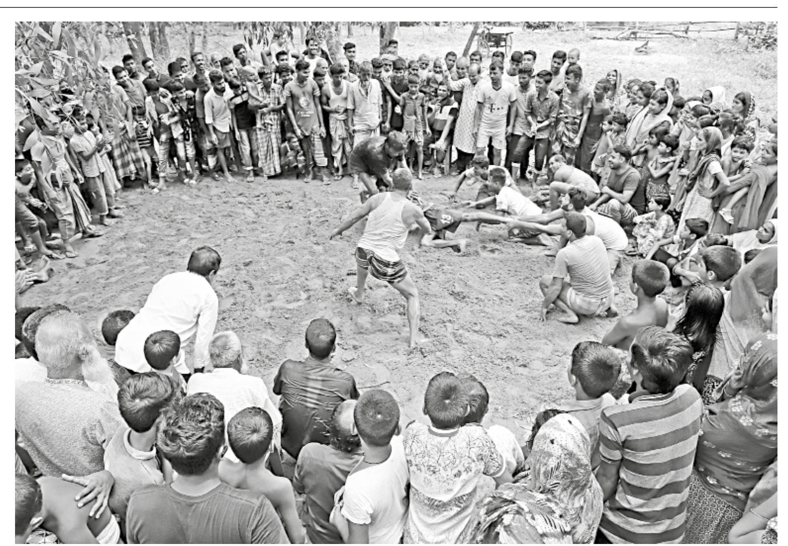
Two groups of contestants, one comprising married men and the other unmarried ones, try to outdo the opponents at a friendly Ha-du-du match at Anandapara village in Ghatail upazila of Tangail on Friday. Locals arrange the traditional rural game as a pastime during different occasions like the Eid holidays.

"Four people have been detained for their alleged involvement in the murder. Policemen have been deployed in the area to avert further untoward incident," said