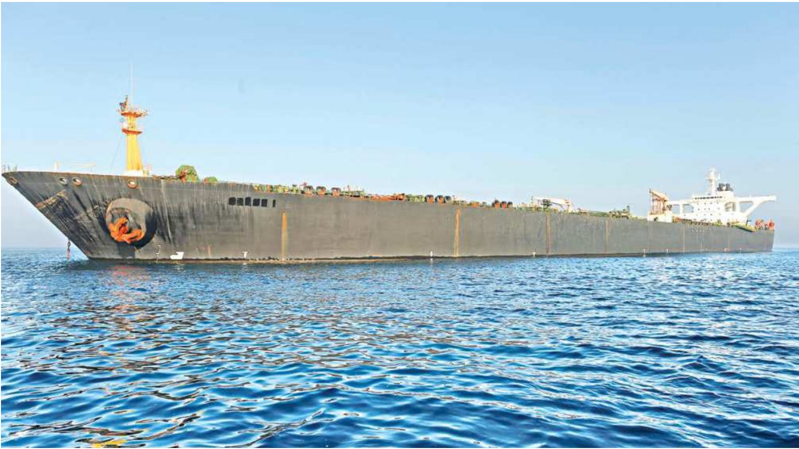
Iranian oil tanker Grace 1 is seen as it sits anchored after the Supreme Court of the British territory lifted its detention order, in the Strait of Gibraltar, southern Spain, on Friday.