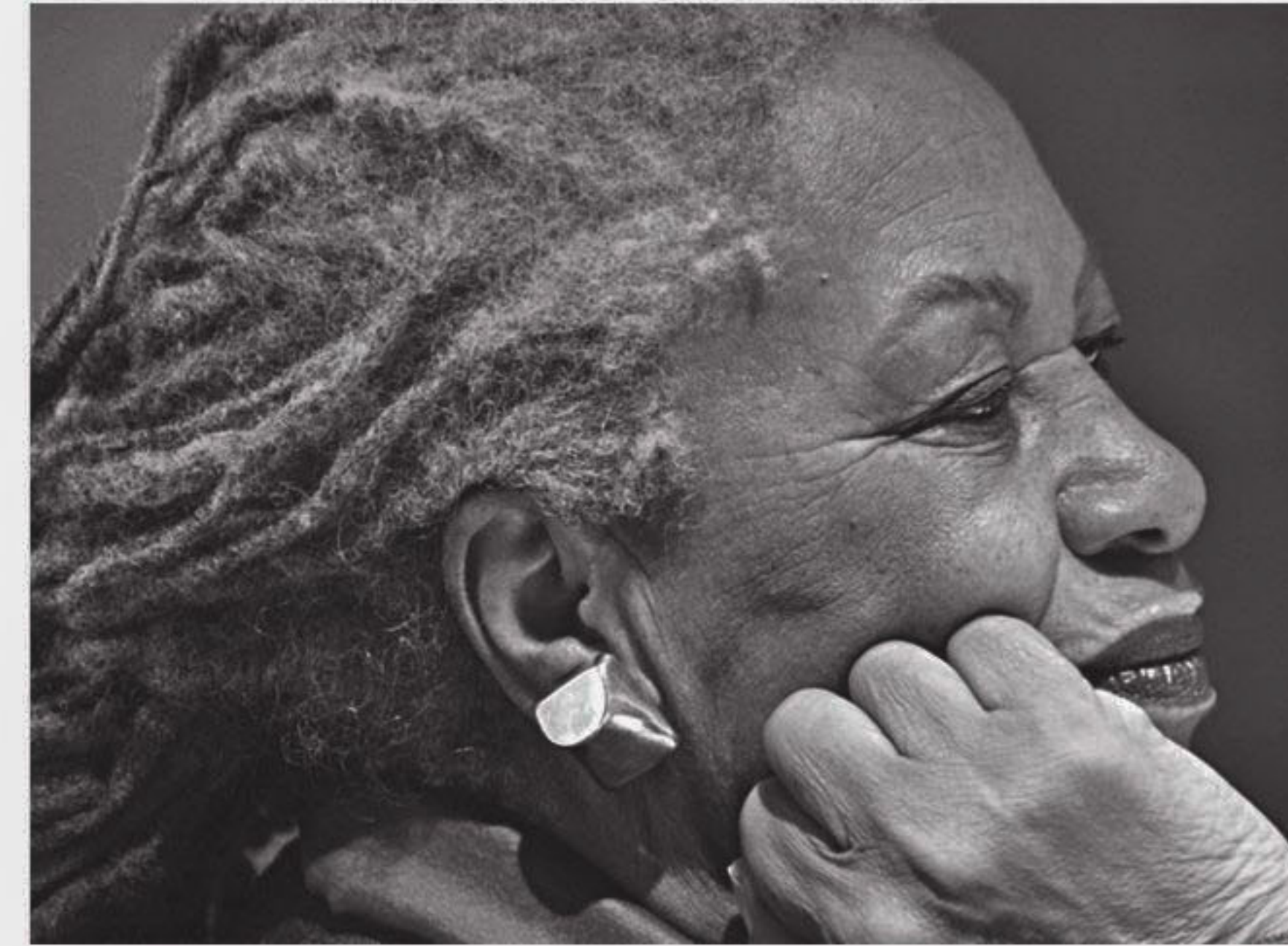
Author Toni Morrison.