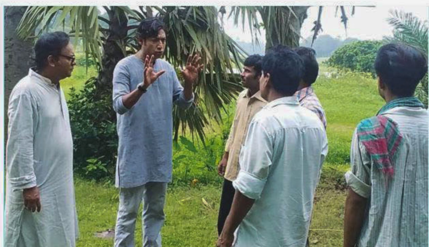
Shedin Sraboner Megh Chilo