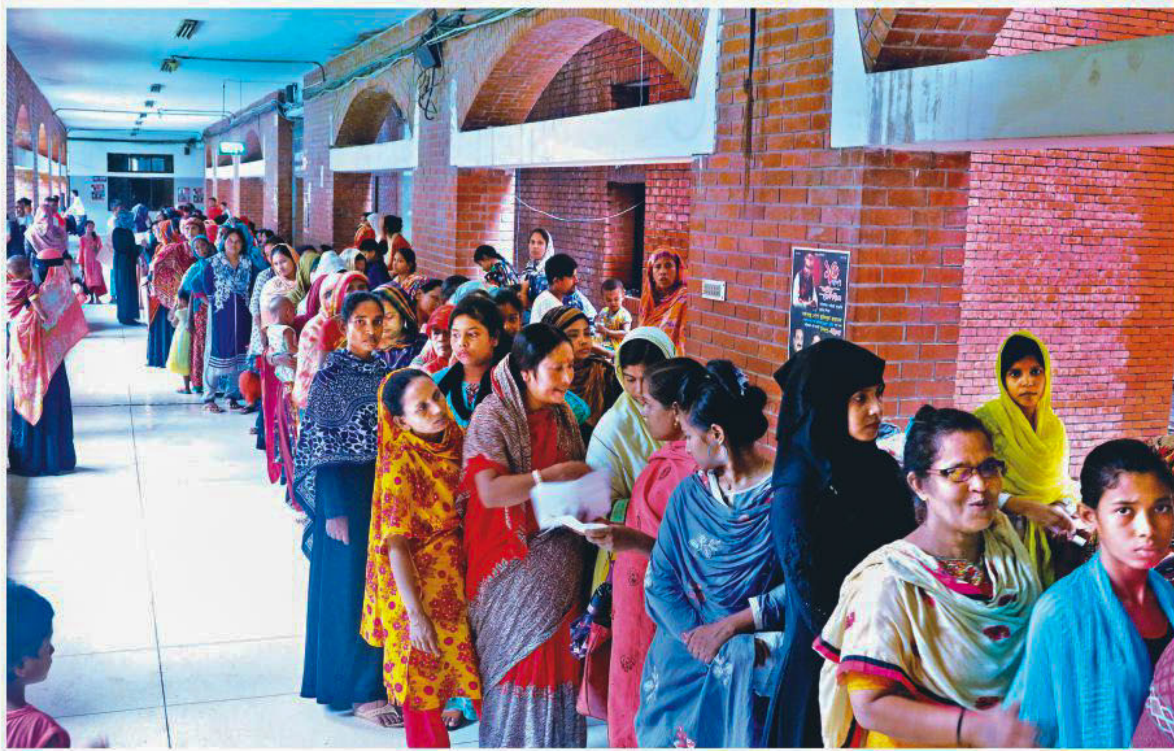
A long queue of family members waiting for blood test reports of their loved ones at Shaheed Suhrawardy Medical College and Hospital yesterday.