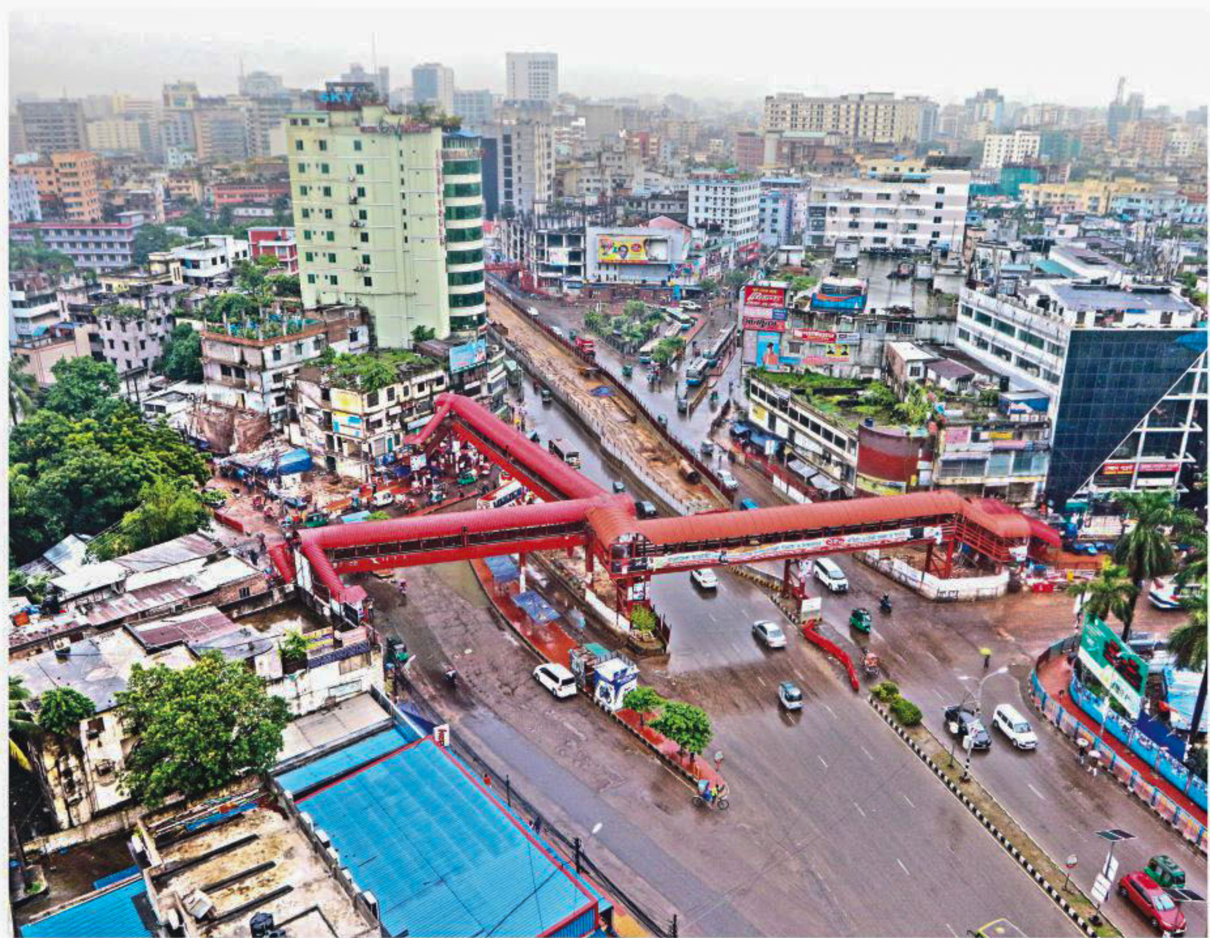
Usually teeming with vehicles, Farmgate intersection remained almost deserted yesterday.

The service tenure of the incumbent commissioner, who was appointed to the top post of DMP four and a half years ago on January 7, 2015 -- was supposed to end on August 7. The government then extended his tenure in office till August 13.