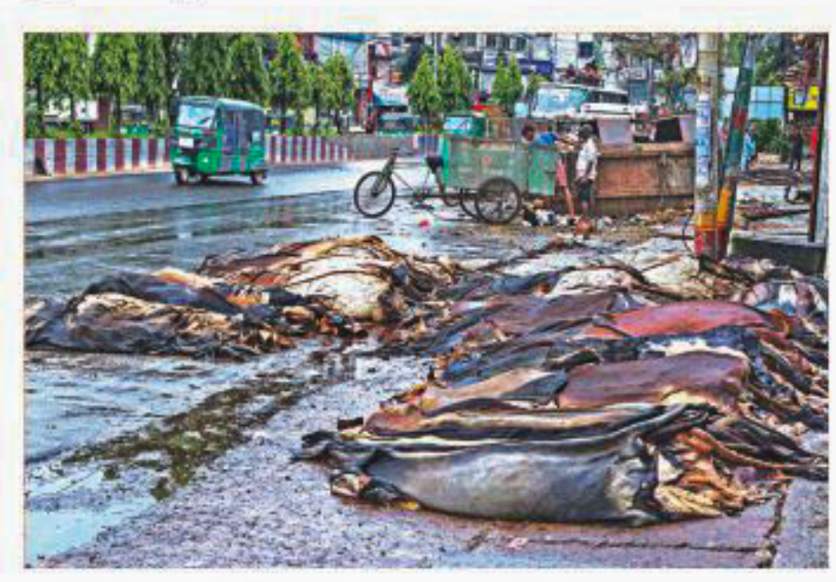
Rawhide left on the streets in Ctg.

Merchants said they had to stop buying rawhide from seasonal traders for a lack of capital as tanners were yet to clear their dues.