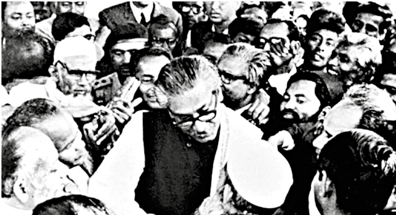
Bangabandhu among his people in Tungipara.

Looking at the happenings in Bangladesh since August 1975 from a