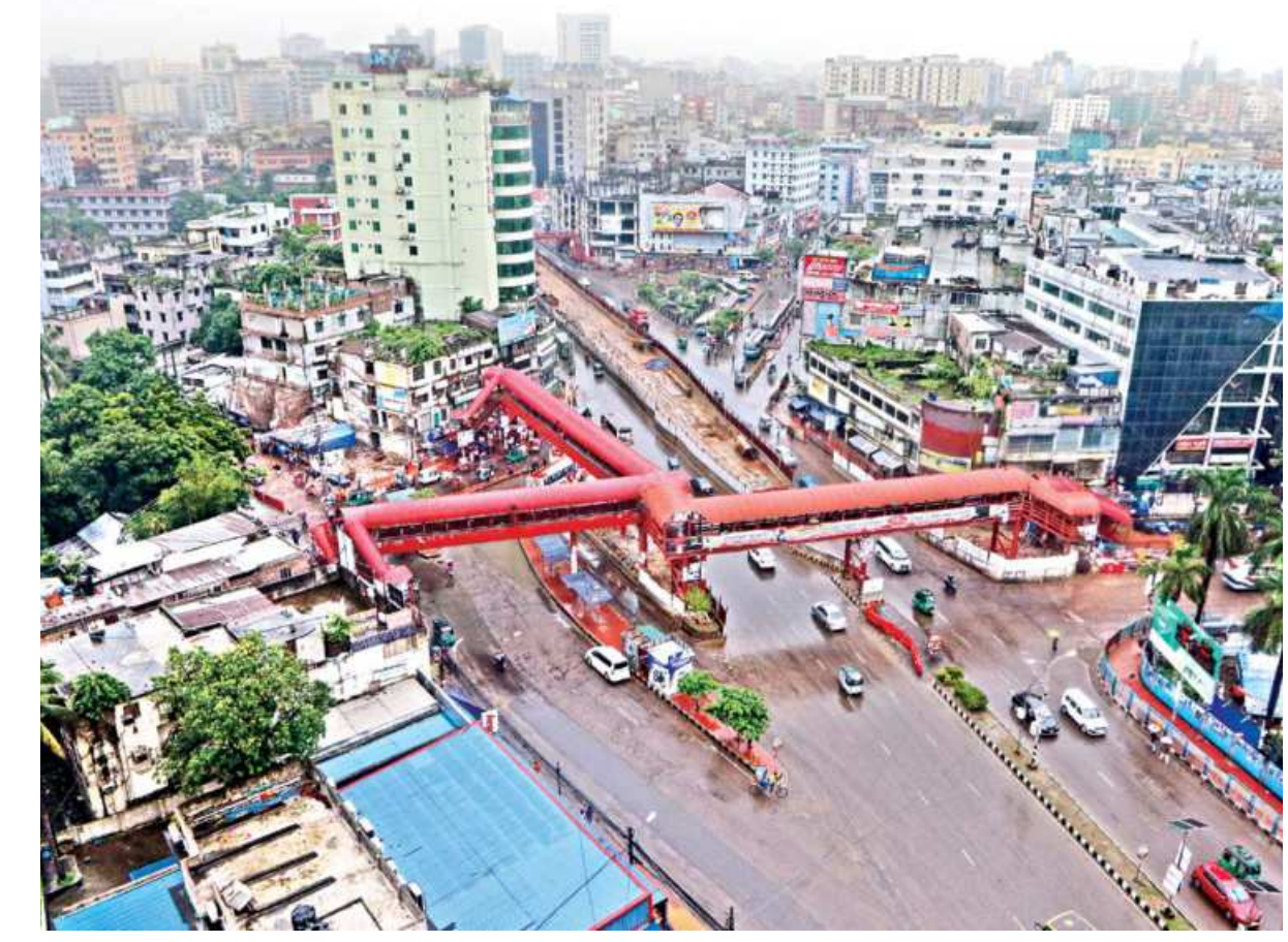
Usually teeming with vehicles, Farmgate intersection remained almost deserted yesterday.

On July 25 this year, Road Transport and Bridges Minister Obaidul Quader had said a cabinet committee on ninth wage board award for newspaper and news agency