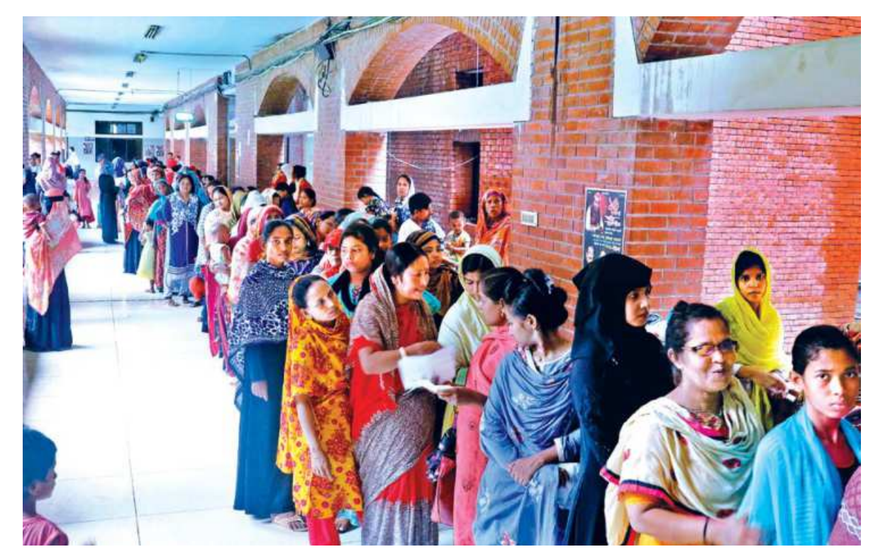
A long queue of family members waiting for blood test reports of their loved ones at Shaheed Suhrawardy Medical College and Hospital yesterday.