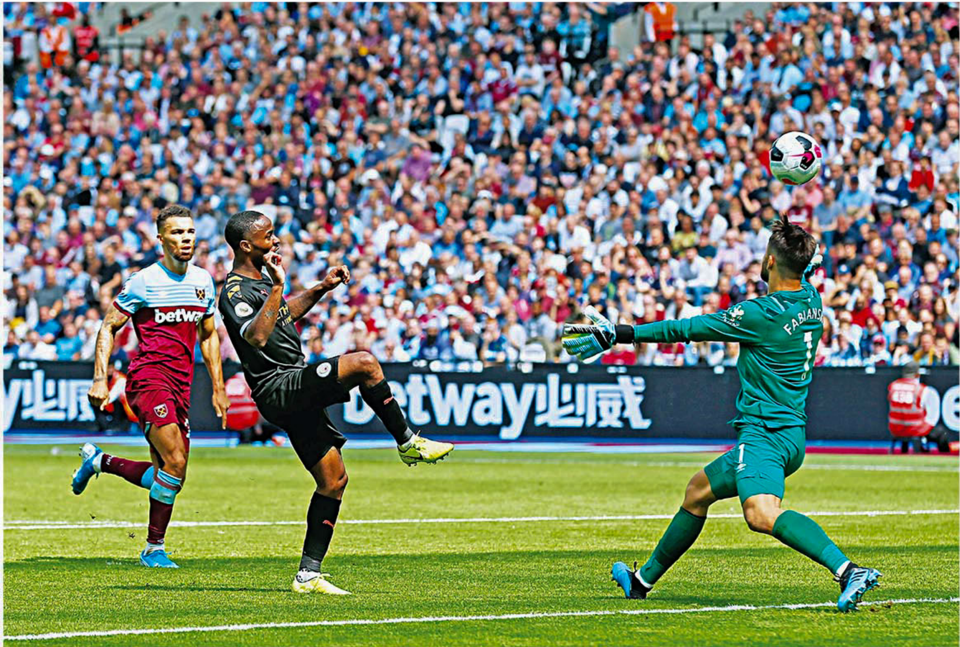
Manchester City winger Raheem Sterling (C) lifts the ball over West Ham goalkeeper Lukasz Fabianski to score the third goal during their Premier League encounter at the London Stadium yesterday.