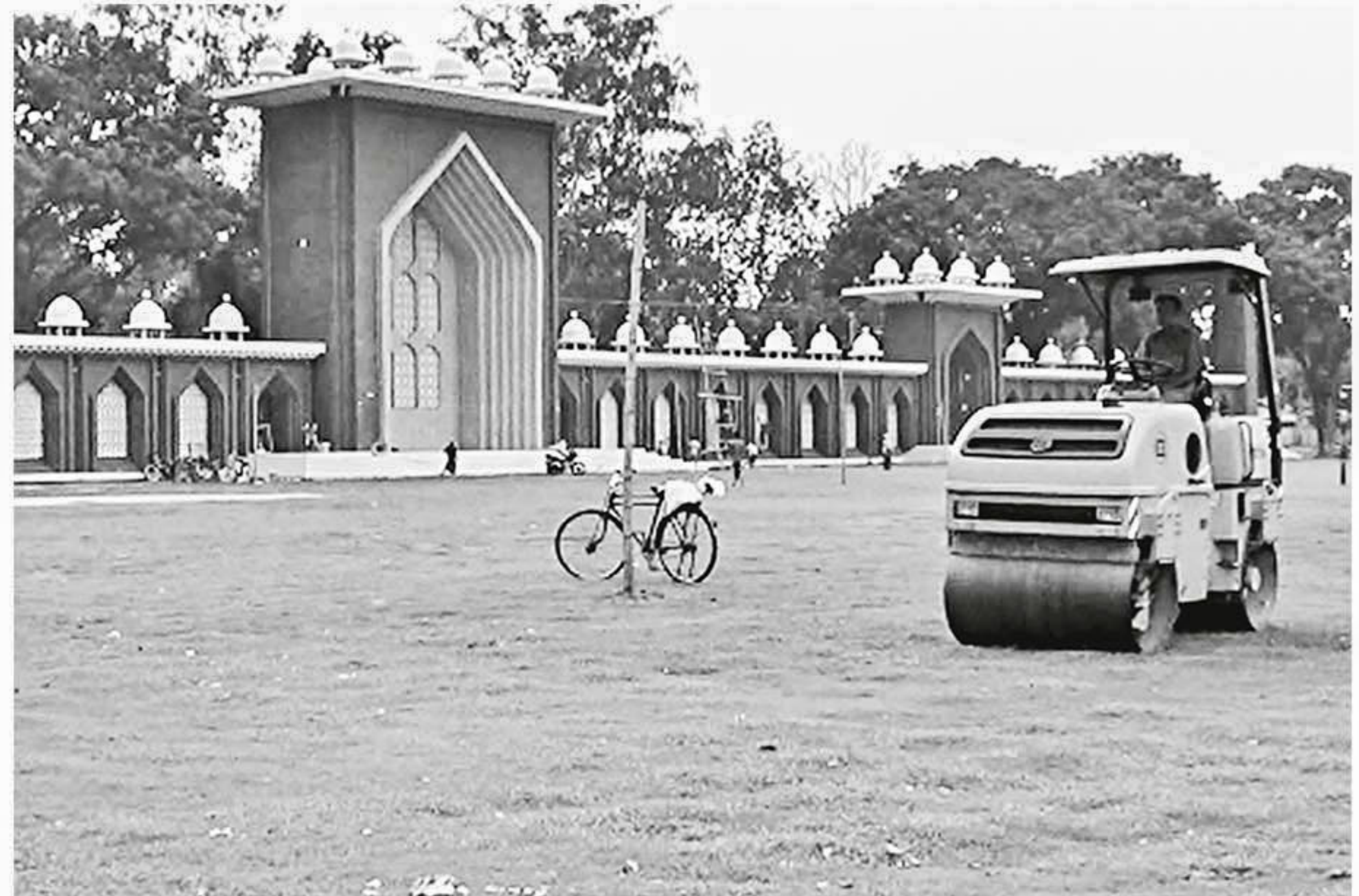
A roller smoothens the ground of Gor-e-Shaheed Boromoydan Eidgah in Dinajpur town yesterday as part of the authorities' preparation to arrange the Eid-ul-Azha congregation there tomorrow. A large number of people from far and near areas come to say Eid prayers at the venue every year.

"Although the victims have verbally mentioned the name of a suspect, they have filed a case against anonymous people. We are trying to find out the culprits," he added.