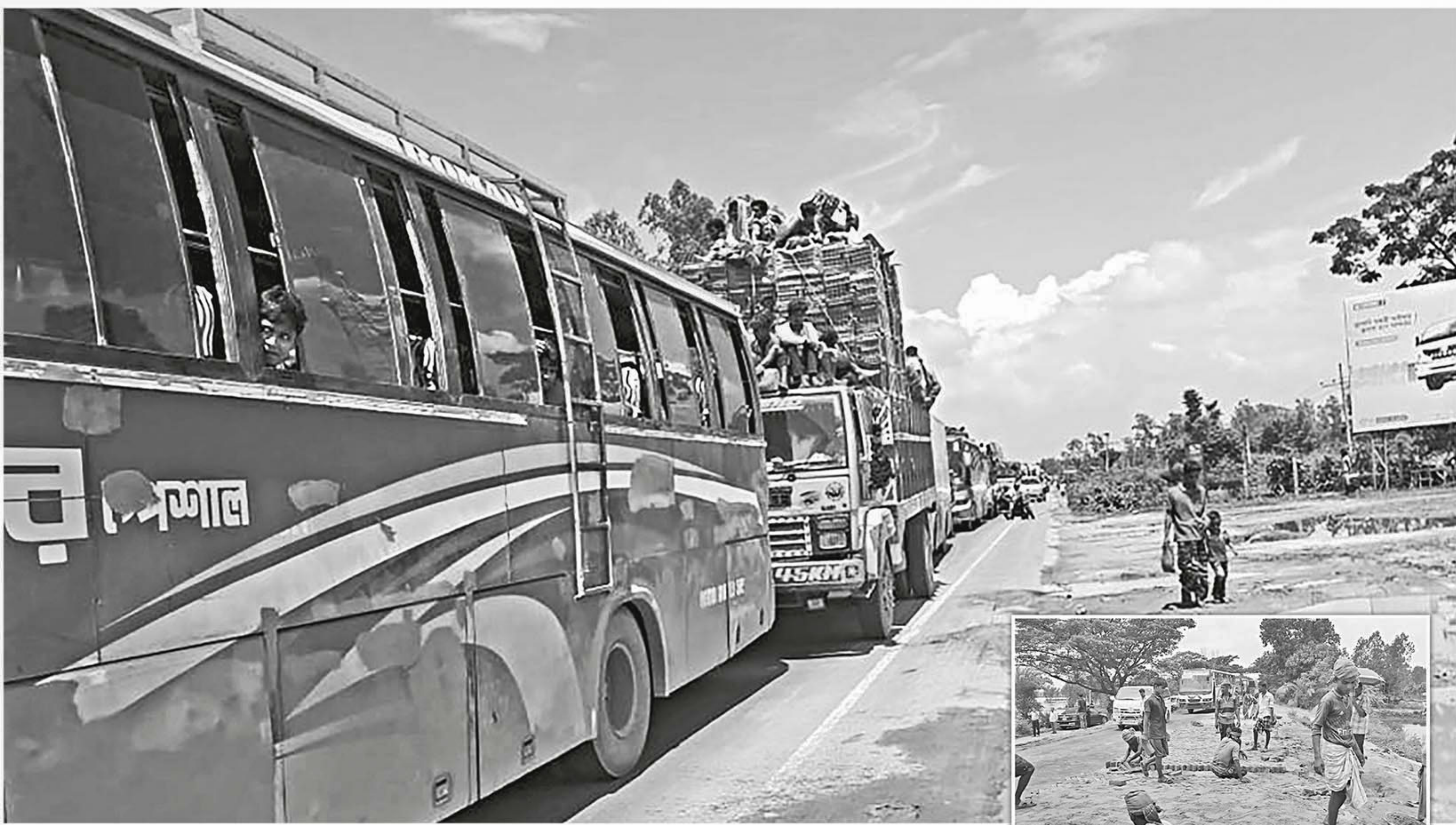
Traffic has been heavy and slow on highways in Sirajganj as Roads and Highways Department is repairing several regional highways, inset , that were damaged by floods. The photos were taken yesterday from Hatikumrul-Bonpara highway.