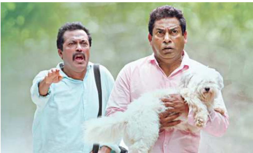
Behind the Puppy