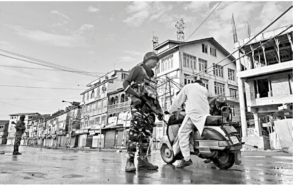
An Indian security officer stops a motorist during a curfew on August 8 in Srinagar, Kashmir.

The damage is already becoming apparent. Tourism, the lifeline of Kashmir, has been devastated; decades of effort by Indian governments to reverse foreign governments’ warnings against travel to Kashmir by portraying the region as safe have been undone. The irony is that Modi, on a visit to Kashmir in 2017, had called on the youth of the state (where unemployment is well above the Indian average) to choose between tourism and terrorism. Tourism could have absorbed many of these unemployed youth. But now foreign governments are again issuing advisories, the shikaras (houseboats) are out of business, and handicraft makers and carpet-weavers, the great artisans of Kashmir, are broke. The Amarnath Yatra—a revered symbol of Indian secularism—which annually takes thousands of Hindu pilgrims