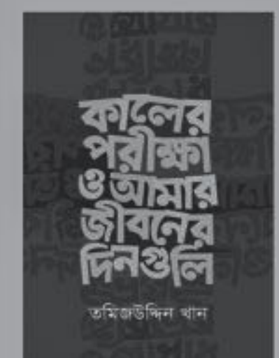
কালের পরীক্ষা ও আমার জীবনের দিনগুলি তমিজউদ্দিন খান