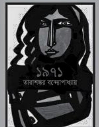
১৯৭১ তারাশর বন্দোপাখ্যায়