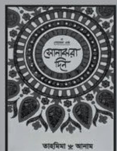
সোনাকরা দিন তাহমিমা আনাম